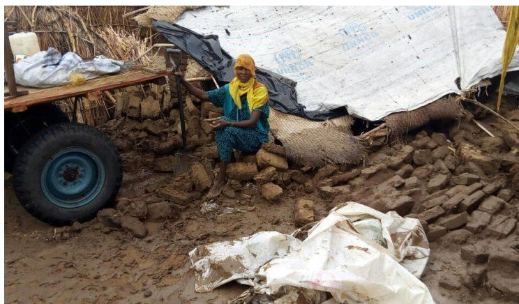
A woman sitting on the rubble of her destroyed home in Kalma IDP camp, South Darfur (June 2017, IA Mission)

The mission included representatives from the Government's Humanitarian Aid Commission (HAC), the UN Office for the Coordination of Humanitarian Affairs (OCHA), the UN Refugee Agency (UNHCR), the UN Children's Agency (UNICEF), the international NGOs World Vision International (WVI), International Medical Corps (IMC), OXFAM America, the national NGOs Great Family Organization (GFO), Popular Organization for Development and Relief (PODR), the Jebel Marra Charitable Organization (JMCO) and IDP leaders.