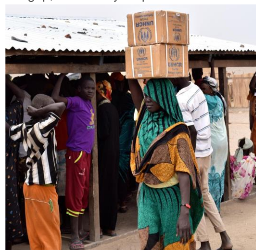
Refugee woman receiving assistance in White Nile (2015 archive, UNHCR)

In White Nile, the international NGO Adventist Development and Relief Agency International (ADRA) reports that there are up to 149 students estimated per classroom per shift, with most schools holding two shifts per day in order to accommodate more students. Lack of access to education services has a direct impact on child protection, the psychosocial wellbeing of the family, increased risk of child labour, and limits children's economic prospects into adulthood.