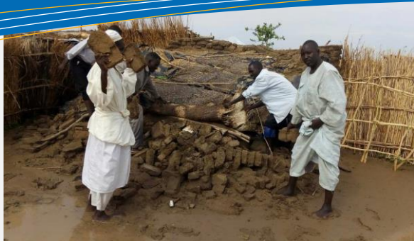
IDP shelter destroyed by flash floods in Kalma IDP camp, South Darfur (June 2017, IA Mission)

17% Reported funding (as of 2 July 2017)