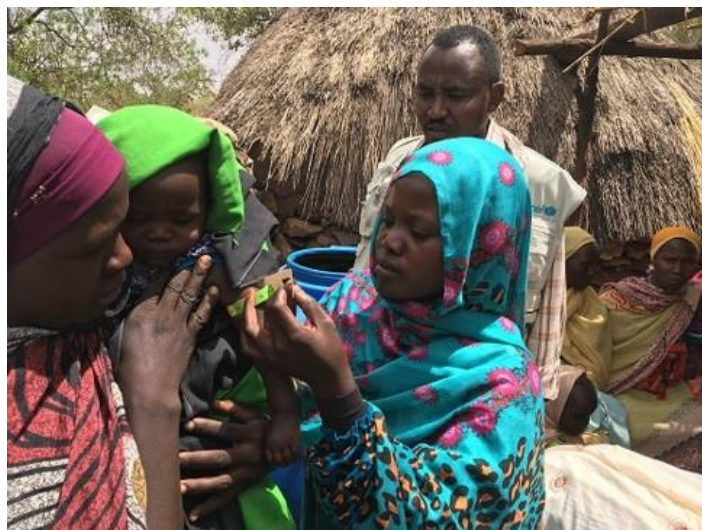
MUAC screening in Jebel Marra, Central Darfur (June 2017, UNICEF)

To treat children with medical complications from SAM, the Golo Stabilisation Centre was established and within one week 16 children with life-threatening forms of SAM were admitted. The campaign also disseminated behaviour change messages on key family practices to households, schools and communities reaching an estimated 9,786 people. Similarly, over 700 children under two years of age