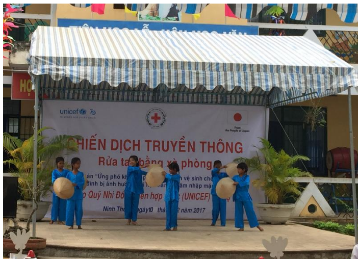
Child-centred handwashing with soap campaigns in Ninh Thuan province supported by Viet Nam Red Cross and School DRM team