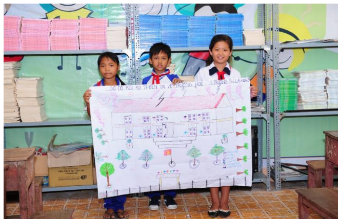
Disaster risk mapping was conducted by teachers and students from Lai Hoa 2 primary school, Vinh Chau district, Soc Trang province