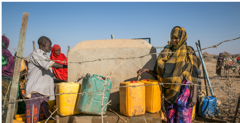
Women access clean water from a rehabilitated borehole, Somali region