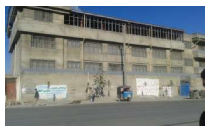
Gurdawara Guru Har Rai 1

This letter has been compiled by staff of the British Embassy Kabul entirely from information obtained from the sources indicated. The letter does not reflect the opinions of the author(s) nor any policy of the Foreign and Commonwealth Office. The author(s) have compiled this letter in response to a request from the Home Office and any further enquiries regarding its contents should be directed to the Home Office.