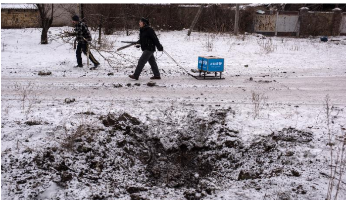
A resident of Avdiivka passes by a fresh shell crater as she carries a UNICEF family hygiene kit and a bundle of wood for heating.