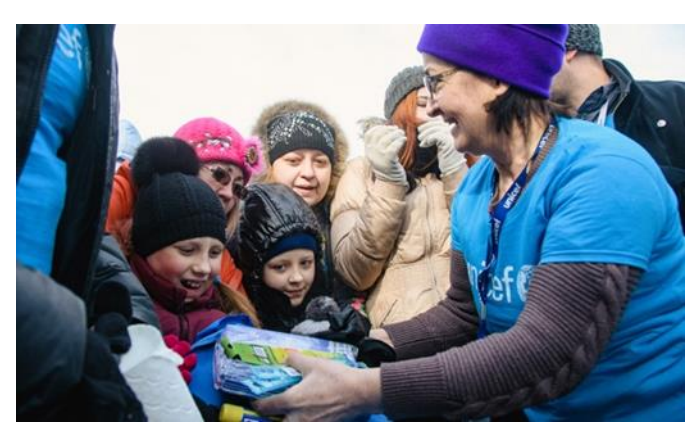
Educational supplies for learning and playing were distributed to children at an emergency heated shelter organized by SES in Avdiivka (©UNICEF/ Artem Het'man/2017).