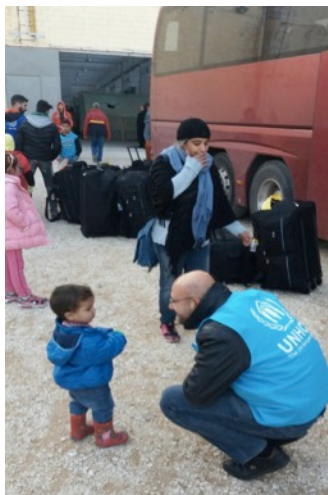
In collaboration with authorities and IOM, UNHCR staff assists asylum-seekers from Kavala site to move to alternative accommodation provided by IOM © UNHCR / December 2016