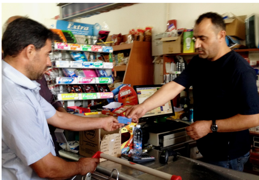
E-card in use to make purchases from a local store.