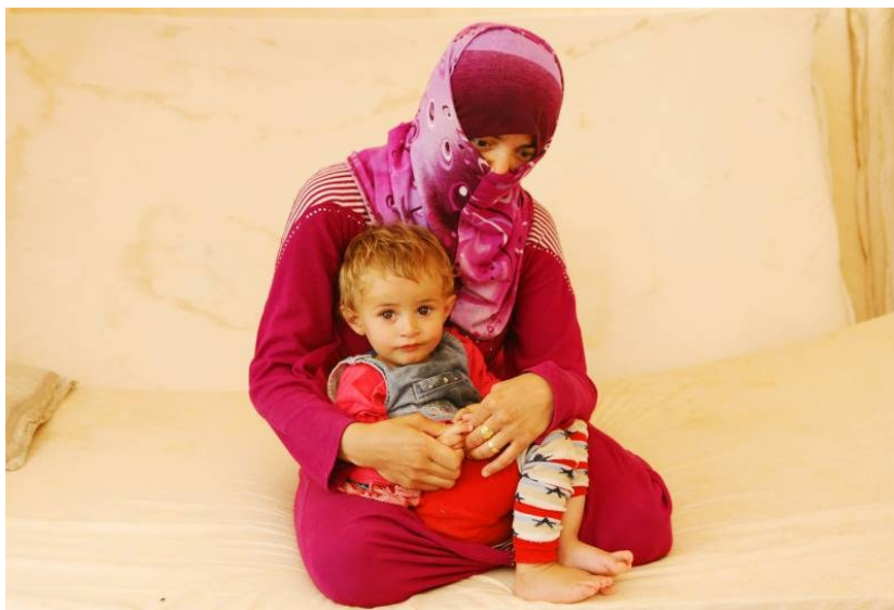
A mother with one of her four young children in Akcakale camp, Turkey.