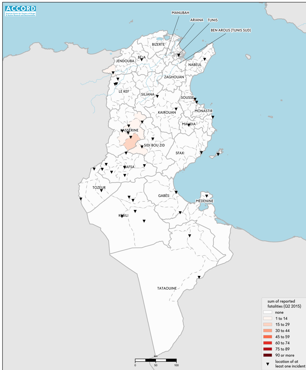
National borders: GADM, November 2015a ; administrative divisions: GADM, November 2015b ; incident data: ACLED, 14 November 2015 ; coastlines and inland waters: Smith and Wessel, 1 May 2015