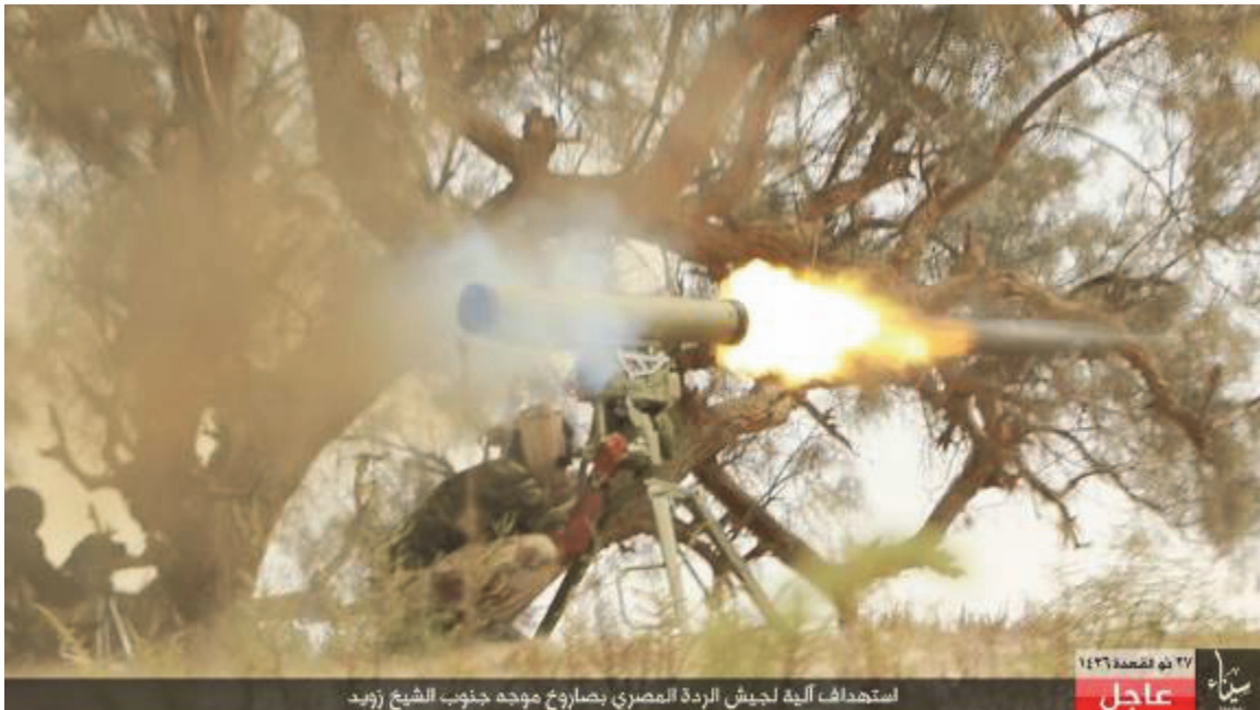
A fighter from the Sinai Province group fires a guided missile at an Egyptian tank near Sheikh Zuweid, September 7, 2015

Clashes between armed groups and Egyptian security forces erupted almost immediately after the outbreak of the uprising. On February 7, 2011, witnesses told a news agency that men they identified as members of the jihadist group Takfir wal Hijra attacked security forces in a two-hour battle in Rafah. 20 On July 29, 2011, armed men attacked a police station in al-Arish, a seaside town 50 kilometers west of the Gaza border, killing an army officer, two policemen and three bystanders. 21 Before the attack, about 100 men had reportedly paraded through al-Arish in cars and on motorcycles, waving flags with Islamic slogans. The night of the attack, armed men also blew up part of a major pipeline that carried natural gas through the Sinai to Israel, the fifth such attack since the uprising. 22 An intelligence officer told the Reuters news agency that the fighters involved in the attack had links to both al-Qaeda and armed Palestinian movements in Gaza. Four days later the newspaper al-Masry al-Youm reported that unknown men in the area had been handing out