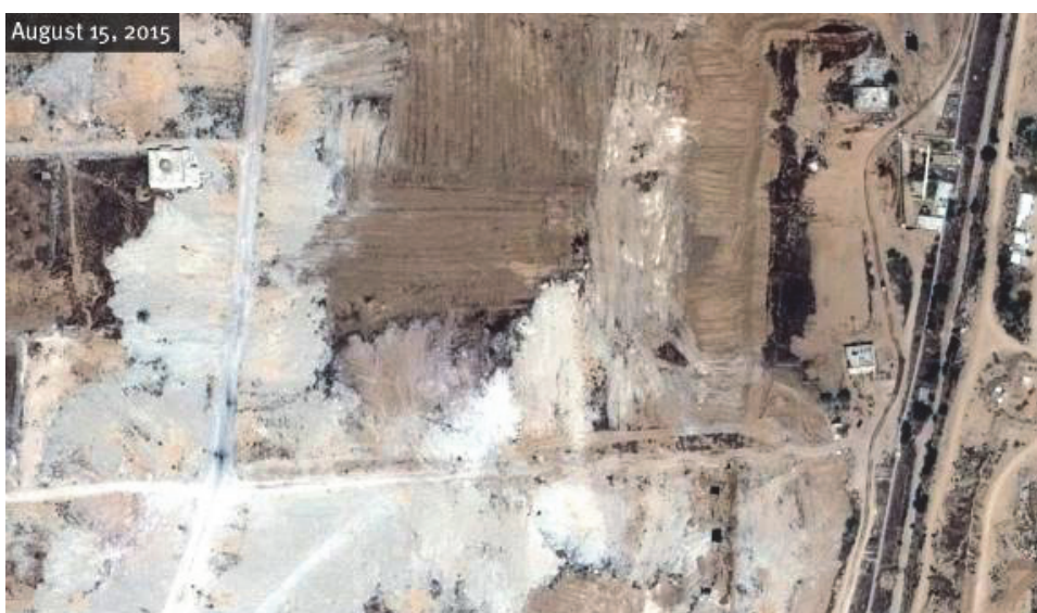
Satellite images showing progression of building demolition in central Rafah between November 1, 2014 and August 15, 2015. Center coordinates: Geo-34°14'41.427"E 31°16'31.33"N; MGRS-36RXV1850260789.