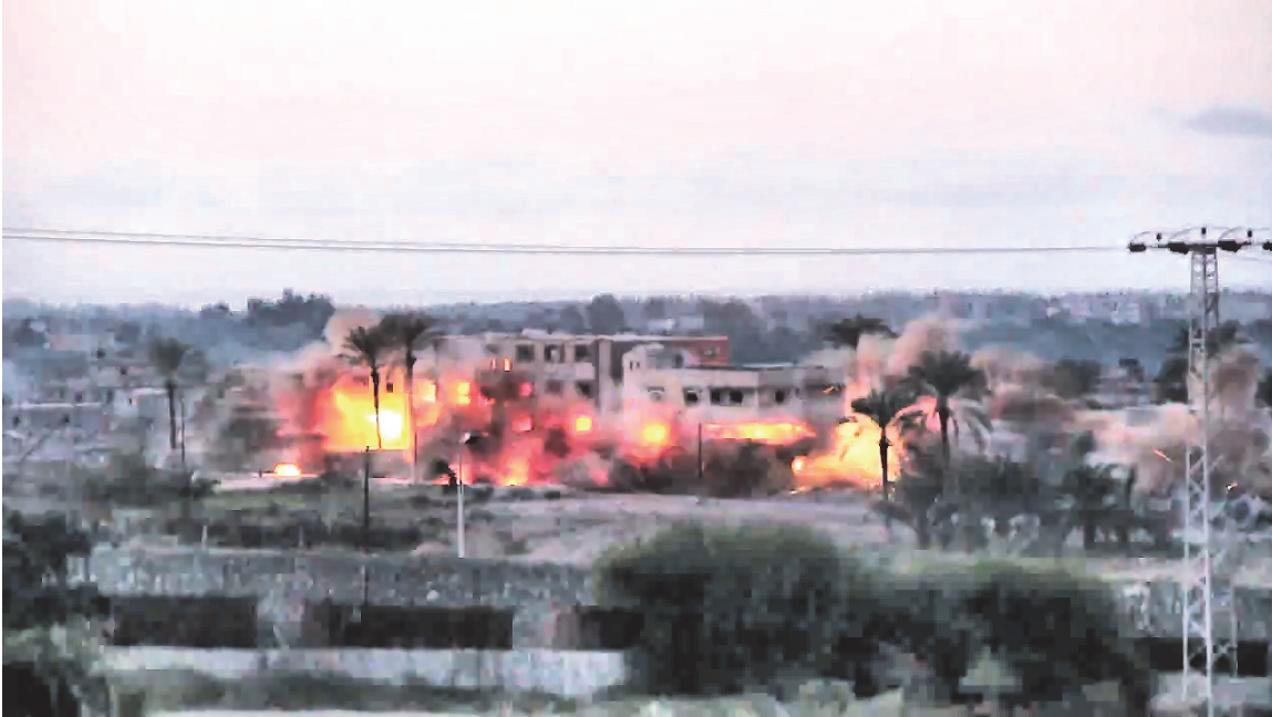
Video shows building demolition with high explosives. Recorded between February 28 – April 12, 2014. Building location: 34°14'19.147"E 31°17'40.744"N.

On September 8, 2013, Hamas spokesman Sami Abu Zuhri told the Washington Post that “there are no tunnels, none, in operation at the current time,” and added that this had never happened before. 117 Nevertheless, in October 2013, Maj. Gen. Ahmed Ibrahim, the commander of Egypt’s border guard, claimed that security forces had destroyed 794 tunnels in 2013, a dramatically higher number than military sources had stated in September. 118 Gen. Ibrahim added that the army planned “to create a ‘safe zone’ in Rafah through which the Egyptian border guard will be able to effectively monitor and secure border areas.” 119