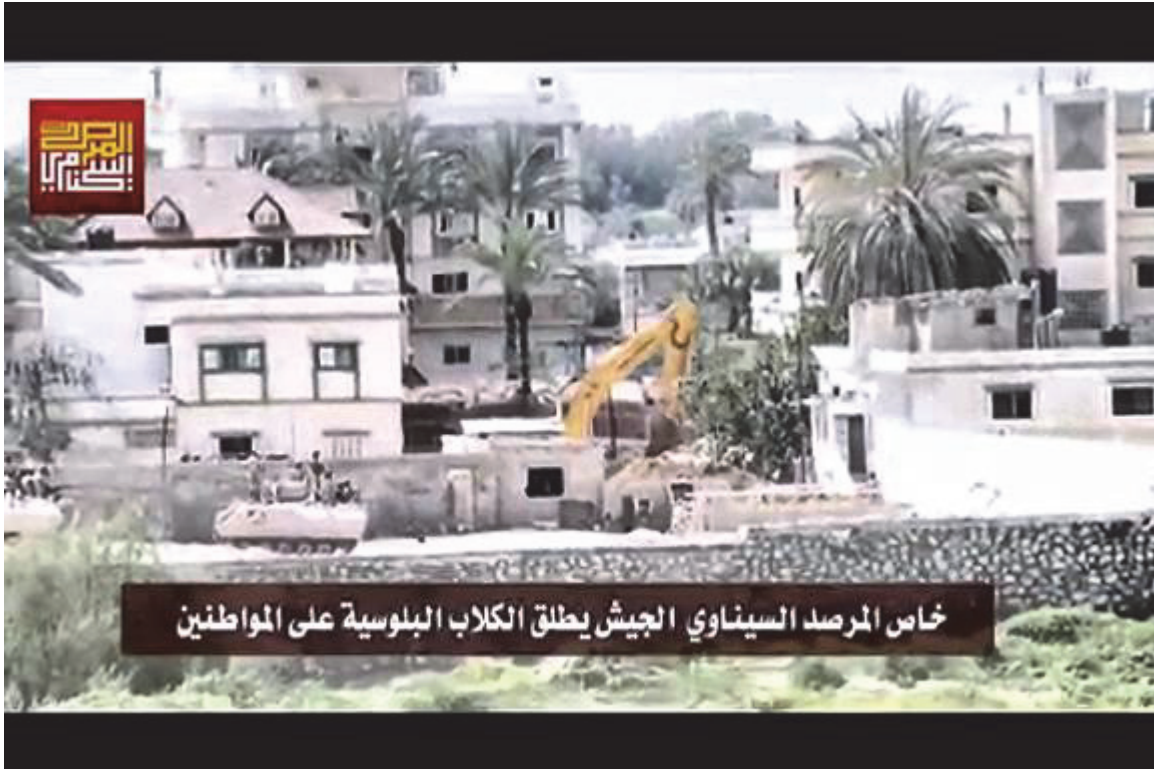
Video shows the active deployment of dozens of Egyptian government soldiers and at least three armored personnel carriers (APCs) next to a military base along the border with Gaza. Excavator is visible in adjacent courtyard demolishing a wall and small building. Recorded between February 28 – April 12, 2014. Video Location- Geo-34°14'20.186"E 31°17'41.961"N; MGRS-36RXV1791762959. Source: https://www.youtube.com/watch?v=01SsydWVCNI