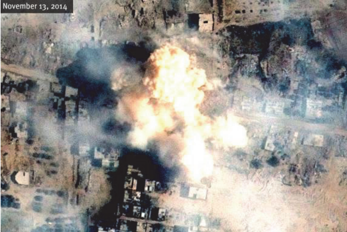
Satellite image shows building explosion in central Rafah on morning of November 13, 2014. Center Coordinates: Geo- 34°14'39.018"E 31°16'16.816"N ; MGRS -36RXV1844360341.