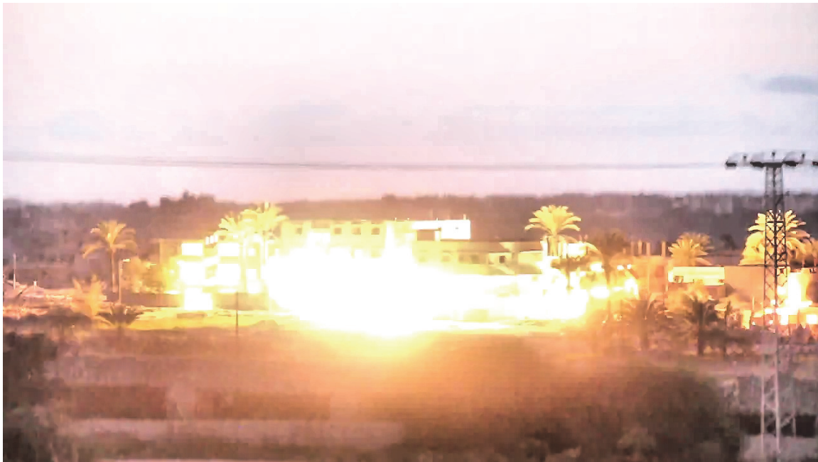
Video shows building demolition with high explosives. Recorded between November 21 and December 2, 2014. Building location: 34°14'21.424"E 31°17'15.663"N.

On October 29, 2014, the same day that Mehleb issued the decree ordering the “isolation and evacuation” of an area encompassing some 79 square kilometers of land in and around Rafah, Maj. Gen. Abd al-Fattah Harhour, the North Sinai governor, still claimed that the buffer zone would extend only 500 meters from the border and encompass just 802 homes. 122 Despite the fact that the military had already demolished hundreds of homes between July 2013 and October 2014, Harhour claimed on the day of the buffer zone decree that only 122 homes had been destroyed. 123 On November 17, a little more than two weeks later, the army announced in a statement published in al-Ahram newspaper that it would extend the buffer zone to one kilometer, dubbing the new extension “the second stage.” 124