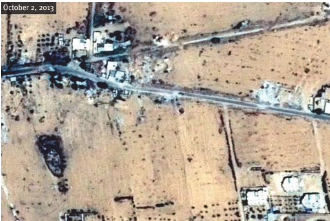
Satellite images shows destruction of cultivated fields, several small buildings and extensive bulldozer tracks on the ground. Recorded on October 2, 2013. Center coordinates: Geo- 34°14'55.998"E 31°15'29.995"N; MGRS- 36RXV1890858905.