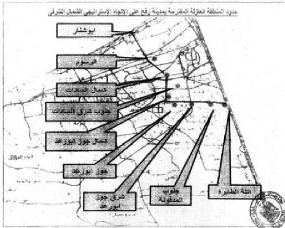
A map of the buffer zone contained in the October 2014 decree shows an area encompassing all of Rafah, far beyond the limits first publicly described by Egyptian authorities.

The military demolished at least 540 buildings between Morsy's removal and the October 24, 2014, attack that precipitated Mehleb's decree, according to Human Rights Watch's analysis of the satellite imagery. Most of these buildings lay within 500 meters of the border but some lay beyond a kilometer from the border. Between October 25, 2014, and August 15, 2015, satellite imagery analysis showed that the authorities demolished at least 2,715 additional buildings.