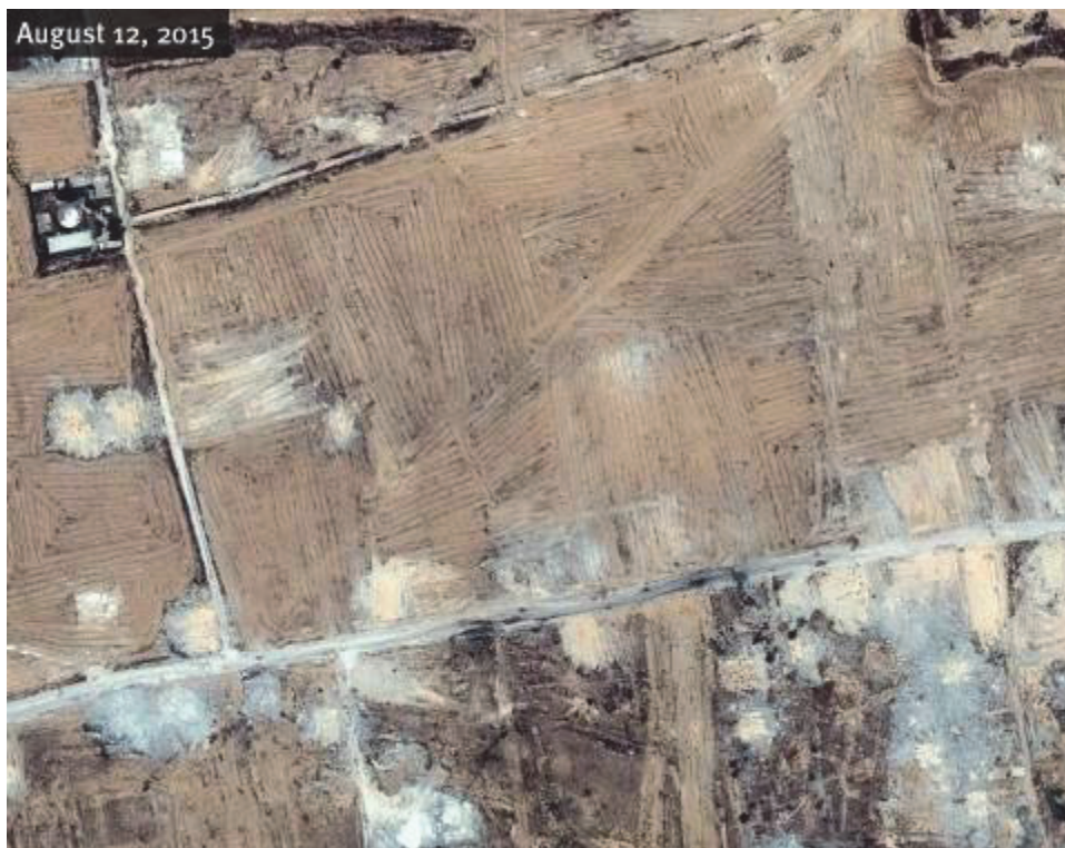
Satellite images showing destruction of farm land in central Rafah between July and October 2013. Pléiades-1 © CNES 2015 / Distribution Airbus DS