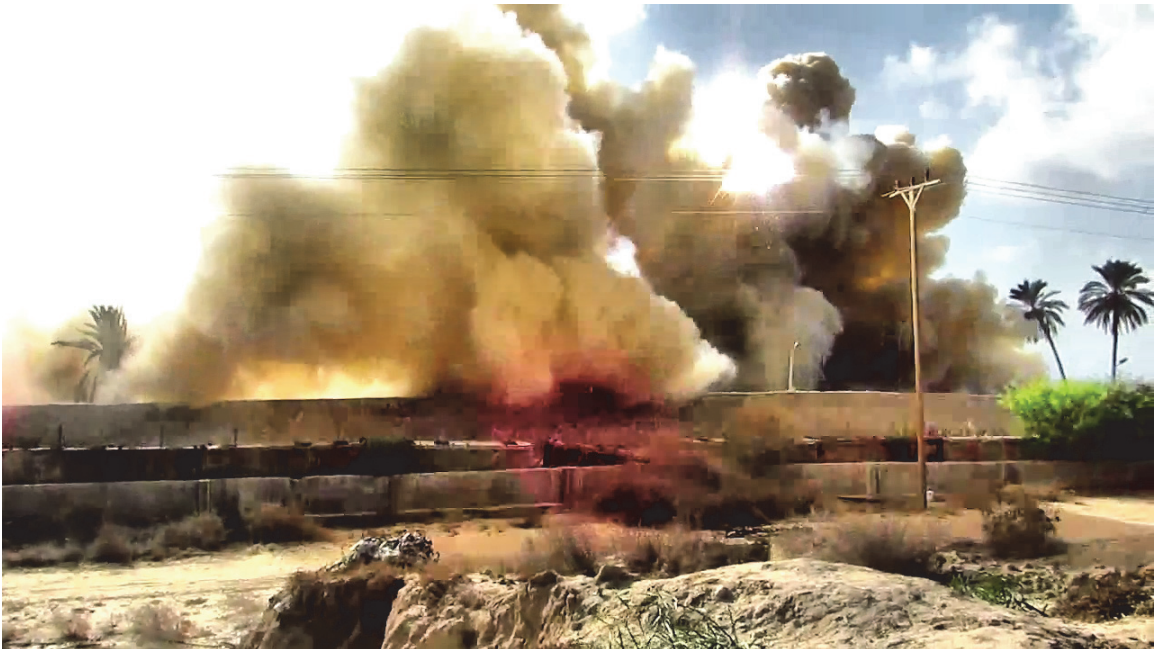
Video of the building seconds after the detonation of high explosives by government soldiers. Recorded November 1-4, 2014. Video location: Geo-34°14'46.823"E, 31°16'31.159"N; MGRS-36RXV1864460785.

Egypt is also obliged to protect the right to property, as set out in the African Charter on Human and Peoples' Rights, to which it is a party. This includes recognizing individuals'