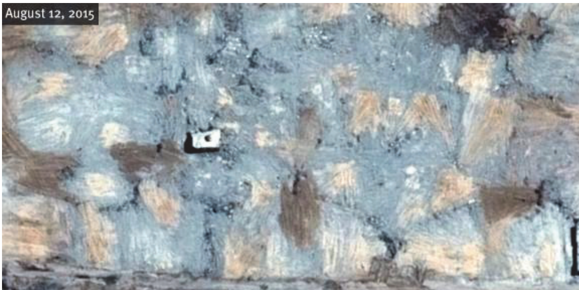
Satellite images show final building demolition in central Rafah between October 5, 2014 and August 12, 2015. Center Coordinates : Geo-34°14'13.106"E 31°17'15.48"N ; MGRS-36RXV1773762140.

Though the renewed threat of violence from insurgent groups in 2014 provided a useful pretext, the Egyptian government had for years taken steps to prepare a buffer zone. In response to pressure from Israel and the United States to more effectively seal the border, former President Hosni Mubarak had ordered a 150-meter-wide strip of land cleared in 2007, but protests forced the government to abandon the plan before it began. Two years