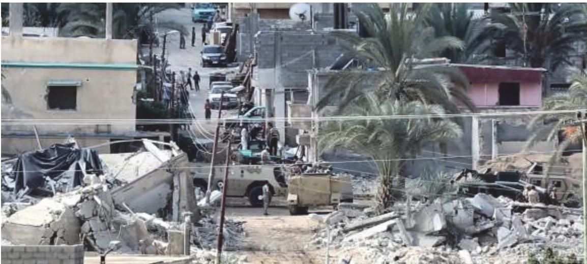
Two wheeled and tracked APCs parked with soldiers observing residents remove their belongings on to pickup truck before demolition. Recorded between October 20 – 31, 2014. Video location: Geo-34°14'28.365"E 31°17'18.796"N; MGRS: 36RXV1814262246. Source: https://www.youtube.com/watch?v=DfuOag5s3vM