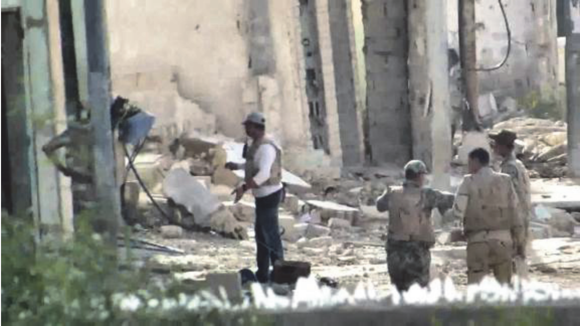
Video shows soldiers setting and wiring the demolition charges in building that is later demolished.