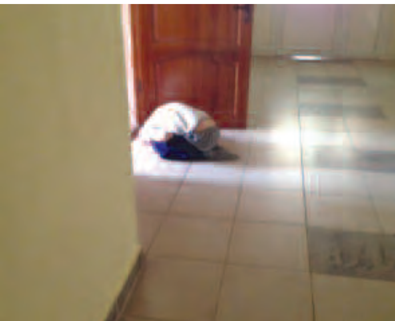
A boy crouches on the floor of a state orphanage for children with disabilities, Sverdlovsk region.