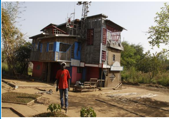
Multi-story shelter in Sherkole camp constructed by a Sudanese refugee