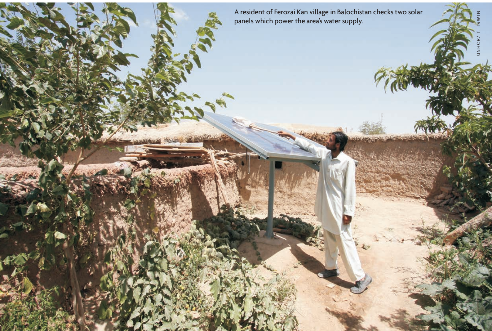
A resident of Ferozai Kan village in Balochistan checks two solar panels which power the area's water supply.