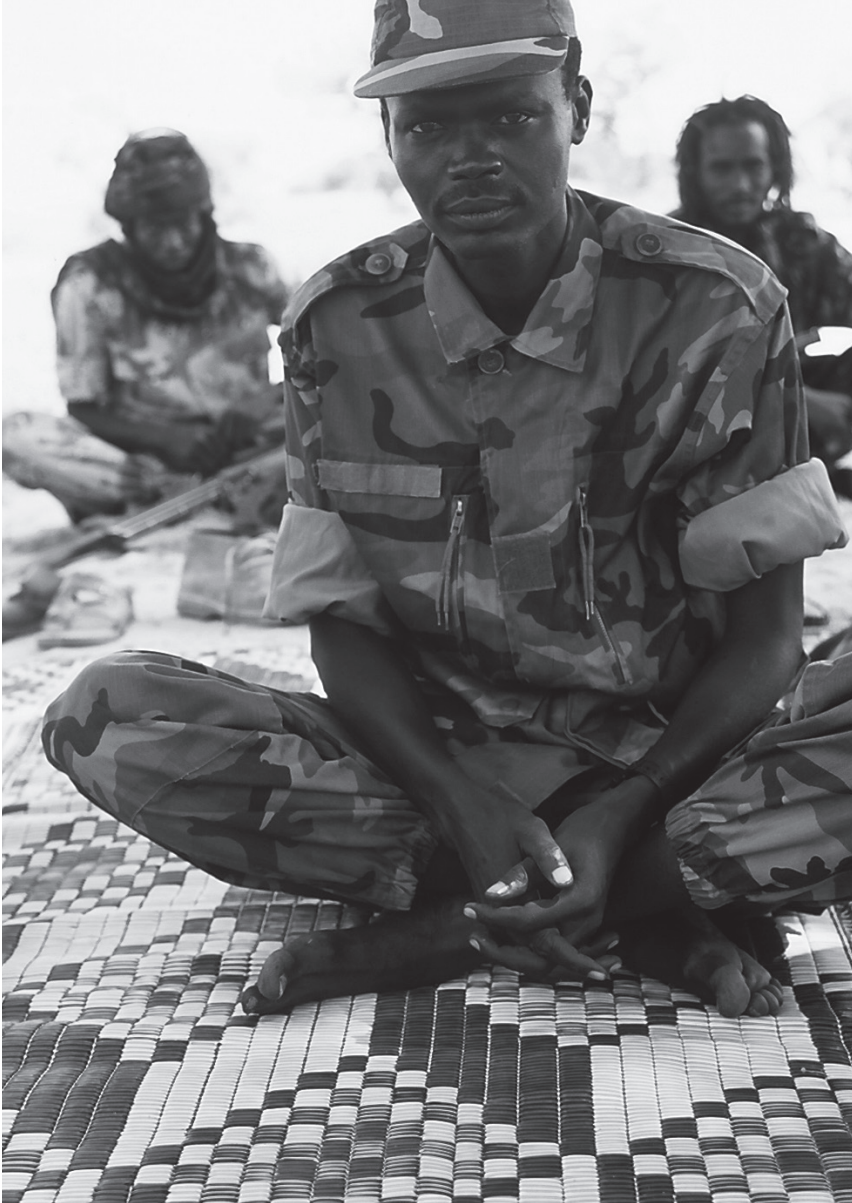
Minni Minnawi, leader of the SLA faction that signed the Darfur Peace Agreement (DPA) in Abuja. Dar Zaghawa rebel area, North Darfur, September 2005.

led by Minni. The latter's heavy-handed tactics also cemented existing opposition among the non-Abdel-Wahid commanders. In December 2005, shortly after the Haskanita conference, SLA reformers met in Karo, near Bir Mezza, 34 and another SLA began to take shape. This loose coalition of North Darfur commanders—mostly Zaghawa opposed to Minni—would later become the Group of 19 (G-19).