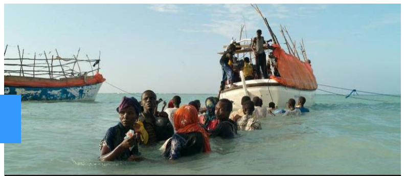
New arrivals from Horn of Africa making their way to Yemen