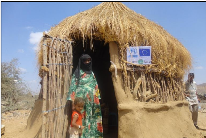
To provide for the shelter needs, UNHCR has built huts using local available materials for extremely vulnerable individuals from the IDP and host communities in Haradh.