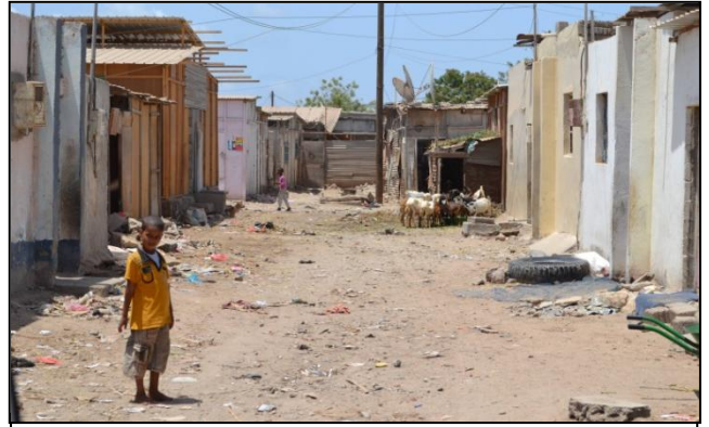
This Somali refugee is one of some 45,000 urban refugees in the Basateen neighbourhood in Aden.