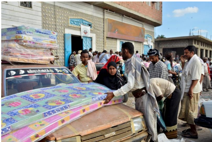
Over 100,000 IDPs have returned to Abyan and begun to resume their daily life amid the destroyed buildings, damaged infrastructure and lack of basic services.

Yemen also has been experiencing internal displacement. Several rounds of fighting in and around Sa'ada Governorate since 2004 have caused repeated and protracted large-scale internal displacement. Moreover, fighting that began in May 2011 in Abyan Governorate resulted in significant internal displacement; however, since July 2012, as hostilities subsided and security began to improve, over 140,000 IDPs have returned to Abyan. For all IDPs in Yemen, UNHCR, with other humanitarian organizations, is promoting durable solutions, including supporting IDPs who decide to return by providing them with life-saving assistance and monitoring their protection. UNHCR also is providing technical assistance to the Government to develop a national policy for addressing and resolving internal displacement throughout the country.