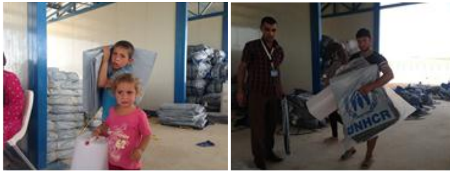
Distribution of winterization items.