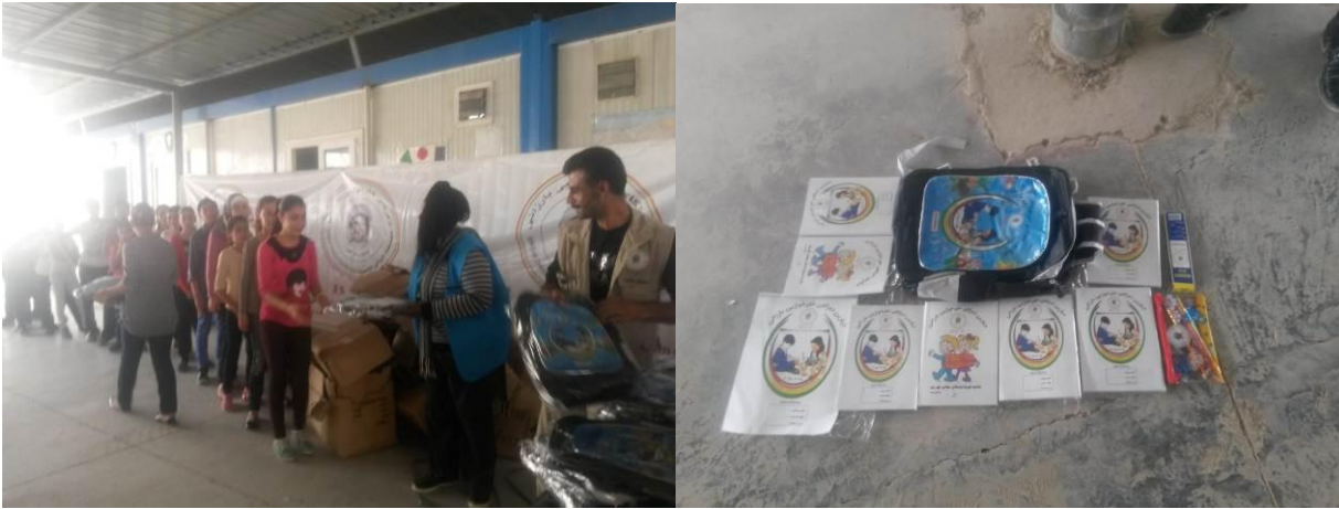
School Bags Distribution by Barzani Charity Foundation at Basirma camp.