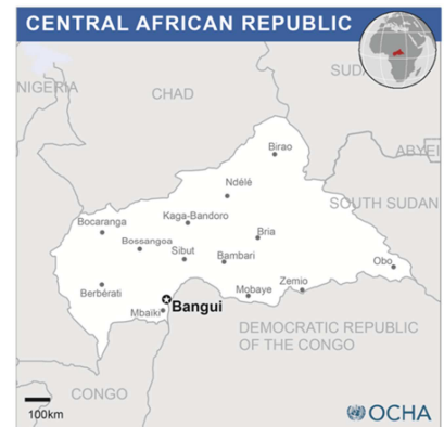
Map Sources: ESRI, UNCS. The boundaries and names shown and the designations used on this map do not imply official endorsement or acceptance by the United Nations. Map created in Dec 2011.