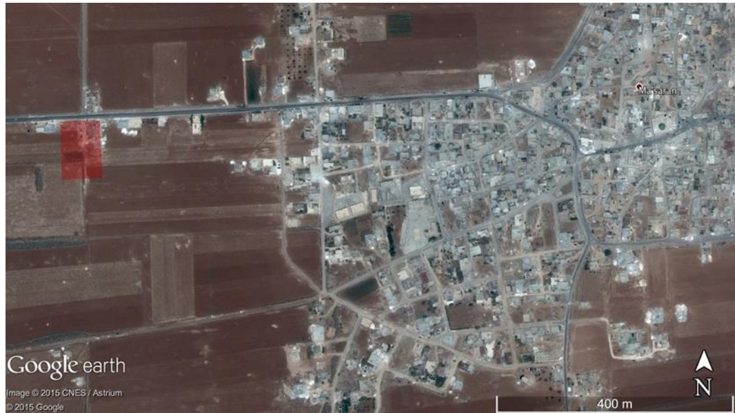
Area outside Maasran where unexploded cluster submunitions were found (in red) following a suspected Russian air strike on 6 October 2015. Imagery date: 18 June 2014. Coordinates: 35.706833, 36.791472

the area on 6 October. 52 Syrian government forces are not considered to be capable of delivering SPBE series submunitions, making it even likelier that Russian armed forces were responsible for their deployment. 53