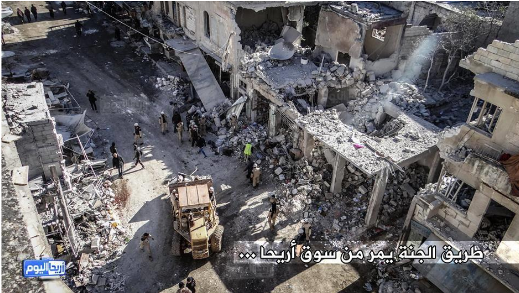
Damage to Ariha market area after 29 November 2015 air strike © Muhammad Qurabi al-Ghazal.

A second activist, “Abu Diab” 39 , told Amnesty International: