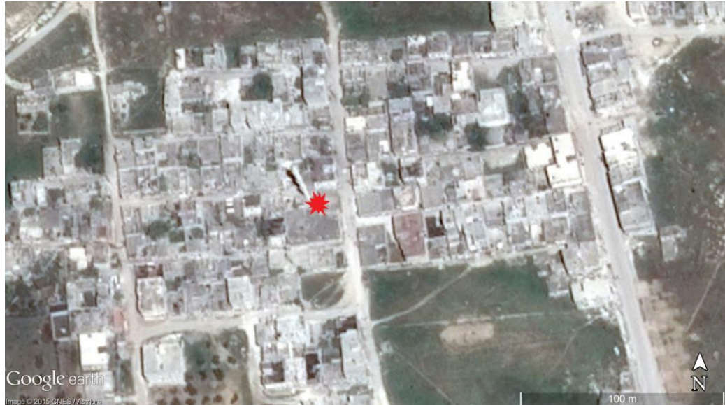
Location of suspected Russian air strike on the Omar Bin al-Khattab mosque in Jisr al-Shughour on 1 October 2015. Imagery date: 14 April 2014. Coordinates: 35.821100, 36.322129

Also on 1 October 2015, at around 11am, a suspected Russian air strike on the Omar Bin al-Khattab mosque in central Jisr al-Shughour, Idlib governorate, killed one civilian immediately, mortally wounded another and injured six more; Amnesty International has obtained the names of all eight individuals. 18 According to one eyewitness interviewed by Amnesty International, there were no military casualties and no military targets in the vicinity, with the nearest checkpoint some 500m away. 19 Reports by Syrian human rights organizations give similar accounts. 20