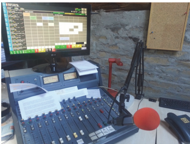
Interior of Radio 021 studio in Novi Sad, Serbia. October 4, 2014.

officials [ruling Serbian party] boycotted my show. Officially, they didn't tell me why but I was told by sources in SNS that they [regional SNS officials] had been instructed to boycott my show... I understood it as political pressure that I was pushed into a corner and I would have been forced to be one-sided in my reporting. As a result I decided to leave journalism because there is no space for independent journalists. 122