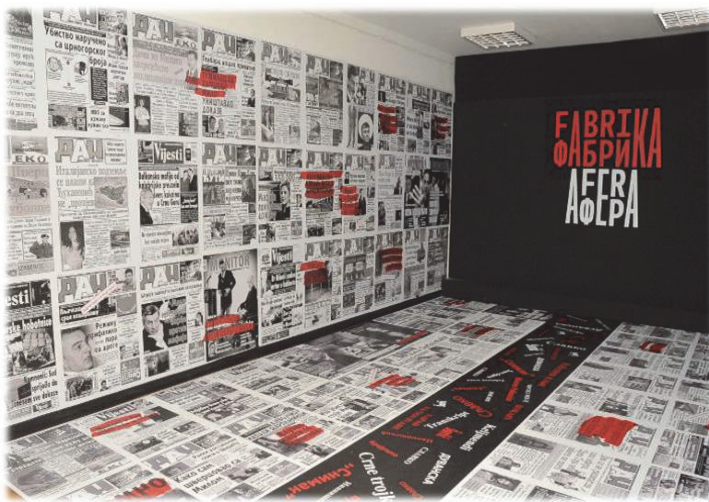
The “Words, Pictures and the Enemy” exhibition at the November 2013 regional Western Balkans media conference inaugurated by Montenegrin Prime Minister Milo Đukanović displaying front pages of three newspapers in Montenegro as examples of “bad” journalism. November 13, 2013. Copyright: “Riječ, slika i neprijatelj.”

Prime Minister Milo Đukanović has a history of engaging in verbal attacks against independent journalists and government critical media outlets claiming they are part of a “media mafia,” involved in organized crime and he has described journalists working for these outlets as “monsters,” “rats,” and “enemies of the state.” 107