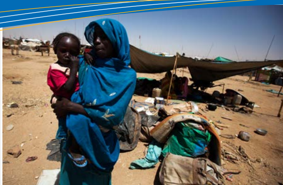
A family displaced in Saraf Omra, North Darfur (UNAMID)