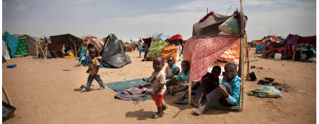
Displaced children from Um Gunya in an IDP camp in Nyala, South Darfur

On 11 March, an inter-agency mission visited Sania Deleiba to assess the needs of some 16,300 people displaced from the Um Gunya area. According to the findings of the mission, displaced people in Sania Deleiba are in need of food, emergency household supplies, emergency shelter, as well as water, sanitation, health and education services. WFP will provide the newly displaced with food aid and the international NGO American Refugee Council (ARC) will open a second health clinic in northern Sania Deleiba. The UN Refugee Agency (UNHCR) will assist with emergency shelter and emergency household items once the number of displaced people is verified. The UN Children's Agency (UNICEF) will engage in hygiene promotion activities and will construct latrines. They will also assist child protection networks to unite unaccompanied children with their families and will support the Ministry of Education to assist children taking secondary school exams. The Food and Agriculture Organization (FAO) will support the Ministry of Animal Resources to vaccinate about 10,000 animals belonging to the displaced people.