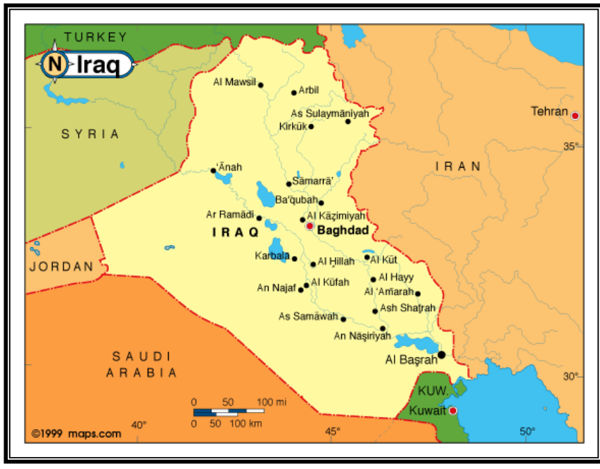
Map of Iraq

Area of Iraq variously cited as between 433,970 (excluding Iraqi half of Iraq-Saudi Arabia Neutral Zone shared with Saudi Arabia, consisting of 3,522 square kilometers) and 437,393 square kilometers. Iraq's official statistical reports give the total land area as 438,446 square kilometers.