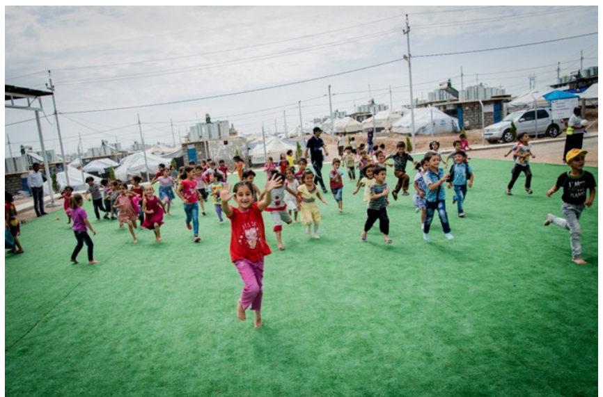
Children playing in Darashakran Camp's child-friendly space, KR-I. ACTED