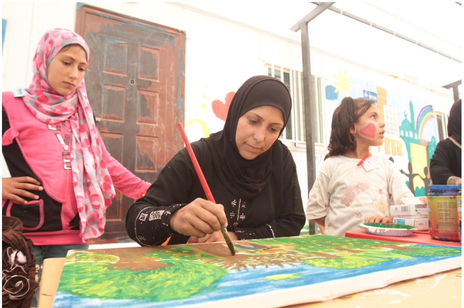
Women participating in a recreational psychosocial activity at an UNFPA Women Centre.

• Lebanon - During May, UNFPA and its partners continued to conduct awareness raising sessions aimed at sensitizing participants on gender-based violence (GBV) issues, referral pathways, consequences and the importance of speaking up. In addition, training sessions on basic living, life skills and problem solving were also conducted for Syrian and Lebanese women. UNFPA and SHEILD have equipped Tebnin Social Development Centre as a safe space for women with electrical items, furniture and a decoration items for the Al Merj Local Counseling Centre.