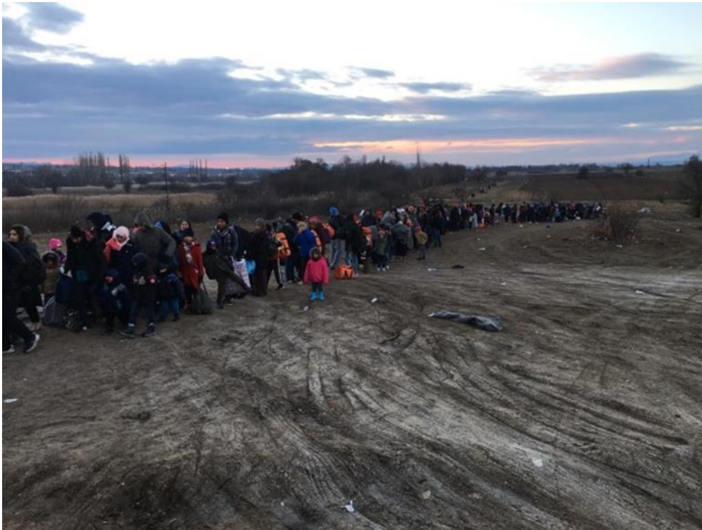
Long queue for luggage scan, Miratovac (Serbia), ©UNHCR, February 2016.

As of 16 February 2016, 288 individuals were relocated out of Italy to eight Member States and 295 out of Greece, totaling 583 persons relocated so far to 14 Member States. In terms of places pledged, 20 Member States and Lichtenstein have offered relocation places.