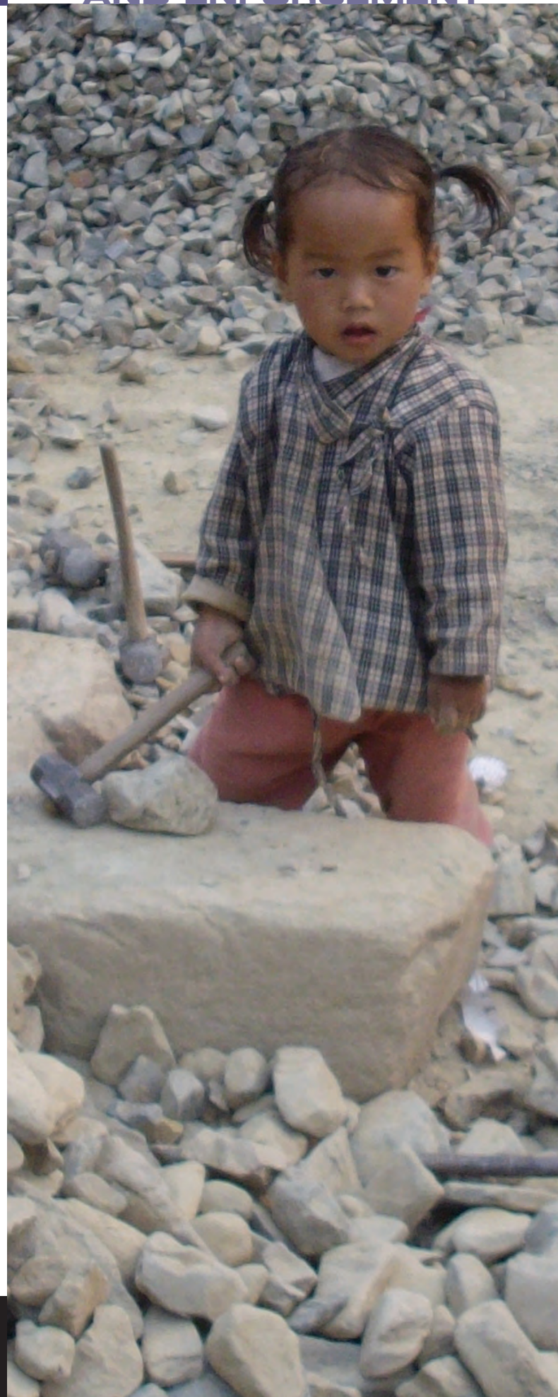
Young Nepalese girl breaks stones in a quarry

Several countries modified their minimum age and compulsory education laws during the period, which may delay the entry of children into the workforce. The African nation of Sao Tome and Principe increased the age to which education is compulsory from 13 to 15. This will likely encourage some children to postpone their entry into work, although children may legally begin working at 14 years of age. Macedonia also increased the age to which education is compulsory—from 16 to 18 years. In Nepal, the Government made education compulsory and free through the eighth grade. Argentina increased the legal minimum age for employment from 14 to 16 years, and specifically prohibited the employment of children under the age of 16 in domestic services. In Egypt, the minimum age for employment was increased from 14 to 15 years. Despite these advances, countries such as Benin, Burundi, Comoros, Equatorial Guinea, Guinea, Mozambique, Niger, Suriname, Swaziland, Trinidad and Tobago, and Uganda continue to allow children to leave school before reaching the minimum age for work, providing