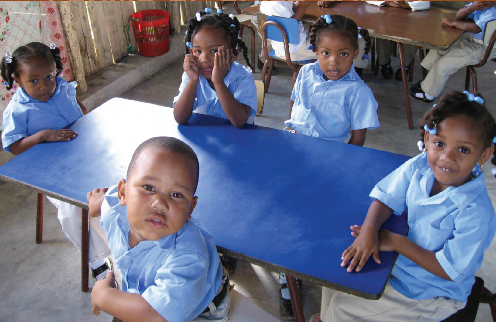
Children at risk of exploitive labor in the Dominican Republic attend a USDOL-funded afterschool enrichment program.