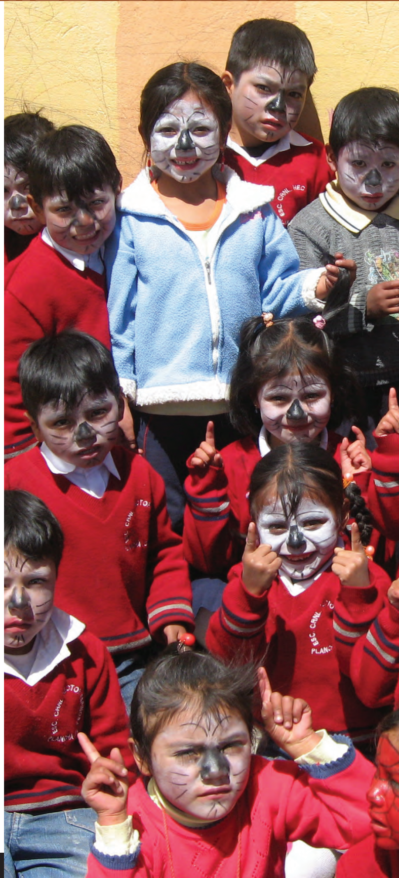
Children at risk of exploitive labor in Ecuador attend a USDOL-funded afterschool enrichment program.

As described in the country profiles, many other donors, governments, international and non-governmental organizations, and employers and workers groups provided funding, other resources, and services over the past year to protect children from exploitive child labor. For example, during the period, the EU provided approximately USD 23.8 million to the Tackle Child Labor Through Education project, which is being implemented by ILO-IPEC in 11 countries.