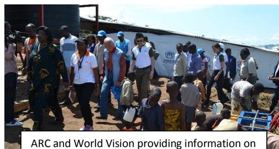
ARC and World Vision providing information on Health, Shelter and WASH facilities.