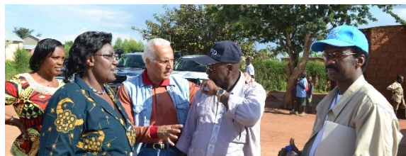
L-R: Vice Mayor of Kirehe District, Hon. Minister of MIDIMAR, UNHCR Representative, UN Resident Coordinator and UNHCR Field Officer.