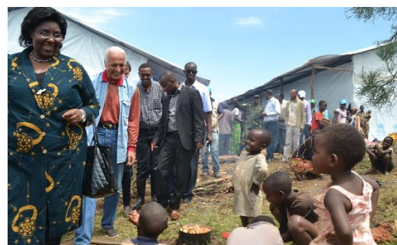
Hon. Minister of MIDIMAR and UNHCR Representative meeting with children refugees.