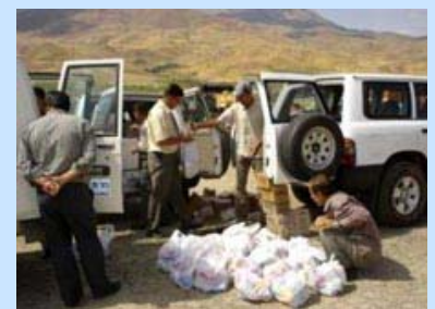
Preparing assistance for returnees - UNHCR