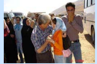
Being re-united with loved ones

Under the auspices of the IOM Capacity Building Programme with the MoDM, six training events in three different countries were organised for 25 MoDM officials. Additionally, UNHCR transferred the ownership to the MoDM of nine vehicles and one crane intended for use by the MoDM in three southern Governorates.