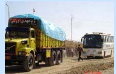
The journey to Iraq – UNHCR

Activities in various UNHCR-supported returnee reintegration projects progressed rapidly. By the end of the month, from a total 334 housing units to be constructed in the south of the country, 159 were completed and construction of a further 125 units was ongoing. Out of 41 quick-impact projects funded by UNHCR, 27 projects were completed. These village-level projects include activities such as refurbishing schools, providing equipment to health centres, cleaning rivers, connecting remote villages to existing water networks, and developing income-generation projects for women. In northern Iraq, the site preparation, excavation, laying of concrete foundations and building of walls to the level of the roof was completed for 182 housing units.