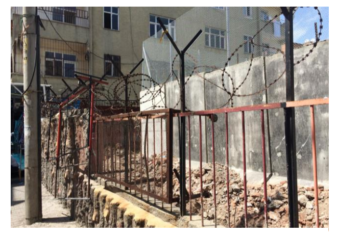
A health care facility in Diyarbakır's Bağlar neighborhood that was being turned into a police station, according to the Health Workers' Union (SES).

International humanitarian law requires parties to a conflict to put in place protective measures to ensure the continued operation of health facilities. The right to health under international human rights law mandates that the state take measures to protect the functioning of health services and ensure they continue delivering health care to the highest attainable standard.<sup>38</sup>