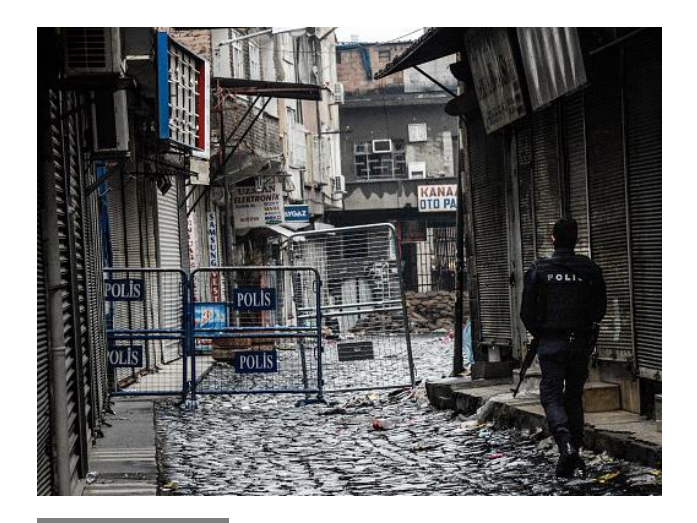
A Turkish police officer patrols a street in the Sur district of Diyarbakır on December 30, 2015 after a curfew was partially lifted.