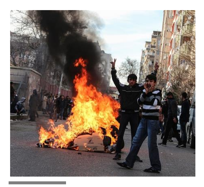
Residents of Diyarbakır protest in March 2016 against curfews imposed on the Sur district of the city.

The blanket curfews have disastrously impacted access to health care services for the affected areas' Kurdish populations, and have facilitated human rights violations by the Turkish authorities. International human rights law states that in times of "public emergency which threaten the life of the nation ... States ... may take measures derogating from their obligations" under the International Covenant on Civil and Political Rights, to which Turkey is state party. But it stipulates that those measures must be strictly proportional to the threat, and may not infringe upon the rights to life, freedom from torture, and equal recognition before the law.<sup>3</sup> Further, the curfews constitute collective punishment, a practice strictly prohibited by international humanitarian law, even in times of public emergency and threats to a nation's sovereignty, as collective punishment is a tool used by governments to punish entire communities for suspected dissent or other actions deemed offensive to the state.<sup>4</sup> The indefinite curfews imposed by Turkish authorities have failed to meet international standards governing public emergencies, including the conduct of counterterrorism operations.<sup>5</sup>