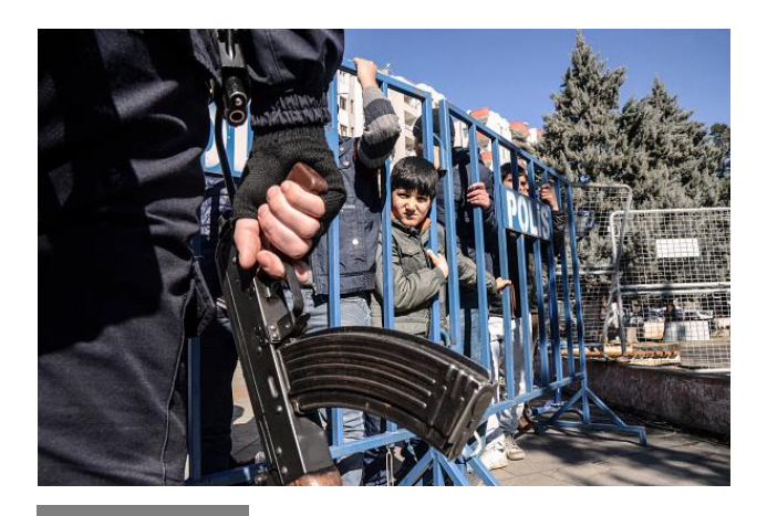
People at a police barricade near the curfewed Sur district of Diyarbakır on February 3, 2016.