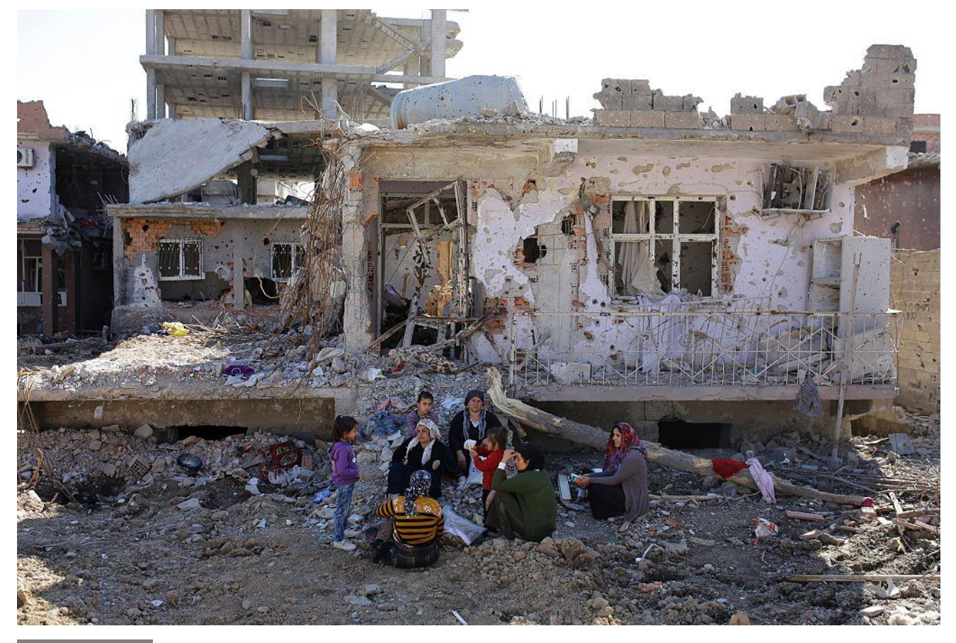
Residents sit in front of their ruined home in Cizre on March 2, 2016, following heavy fighting between government forces and Kurdish fighters.

Turkish security forces and armed opposition groups have both interfered with medical transport units through the use of blockades and checkpoints, failed to provide adequate protection to emergency transport vehicles, and failed to prevent the targeting of emergency response vehicles.