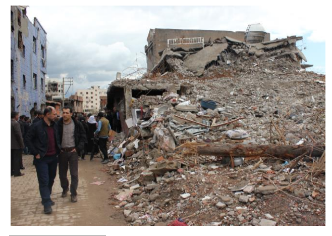
Men look at a collapsed building over the site of one of the Cizre basements, where 130 to 190 people died. The sites were later razed, reportedly on the orders of Turkish security forces.

Access to emergency medical care in the southeast has been the focus of several petitions to the ECHR. In a decision issued on February 2, 2016, the Court underscored the requirement that the curfews end and that Turkish authorities take all necessary steps within their powers to protect the right to life and physical integrity of those seeking immediate access to medical assistance. On January 26, however, the Court had rejected the petitions from 14 people in Cizre who were requesting immediate medical assistance on the grounds that the applicants had not yet exhausted domestic remedies before