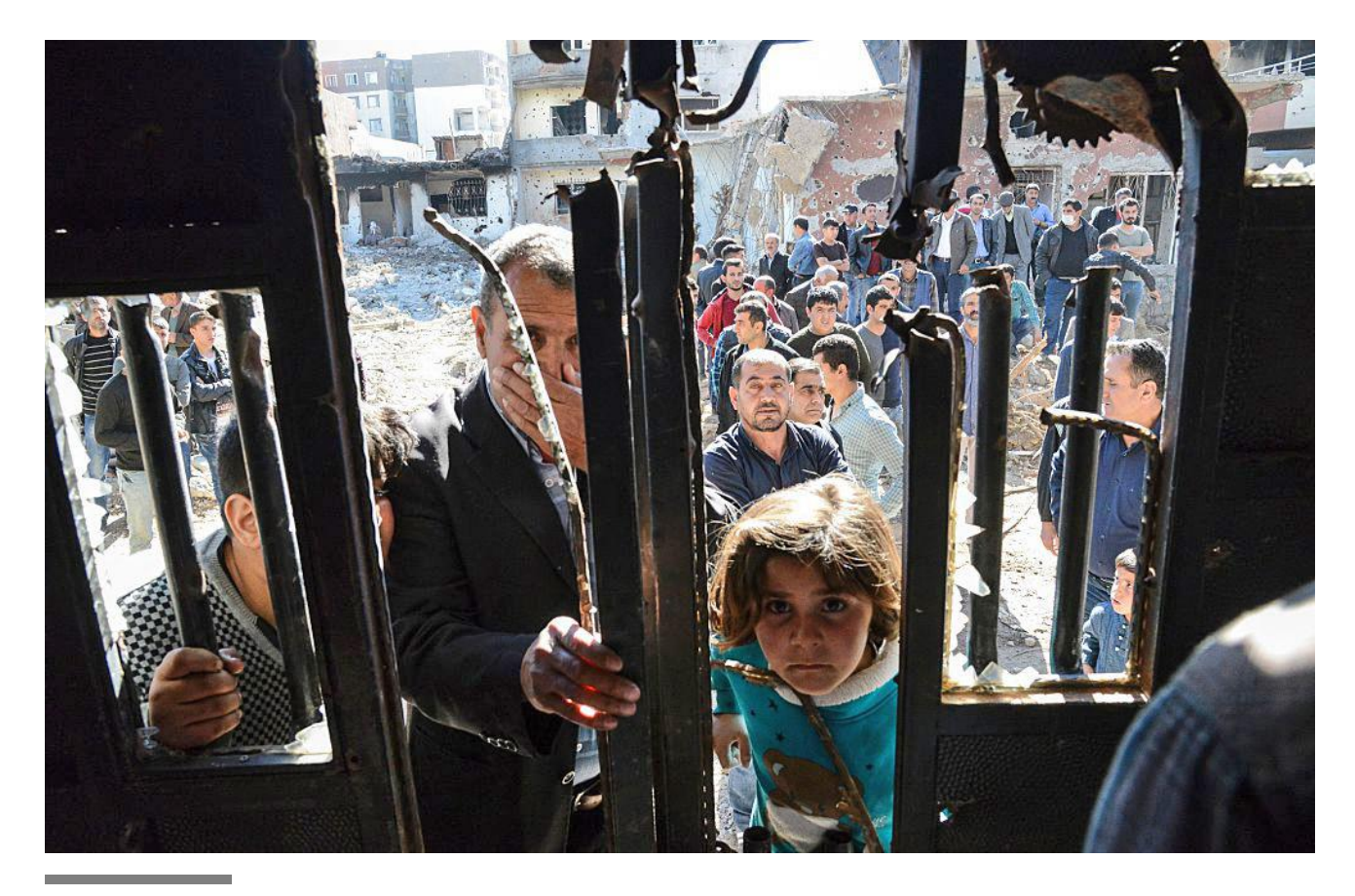
A girl looks at a dead body amid the rubble of damaged buildings on March 2, 2016, following heavy fighting between government troops and Kurdish fighters in Cizre.

Medical workers providing assistance to the wounded and sick are afforded special protections under international humanitarian law. Few of these protections were respected in southeastern Turkey between July 2015 and June 2016. PHR documented indiscriminate attacks on emergency health personnel, indicating that, at the very least, parties to the armed struggle failed to distinguish between a combatant and non-combatant, something they are obligated to do under the laws of war. Various civil society organizations have independently documented assaults on health care workers attempting to provide care to the wounded and sick in neighborhoods under curfew. Whether these deaths constitute extrajudicial or indiscriminate killings, they must be investigated in accordance with Turkey's obligations under international law to protect against violence and ensure justice for human rights violations.