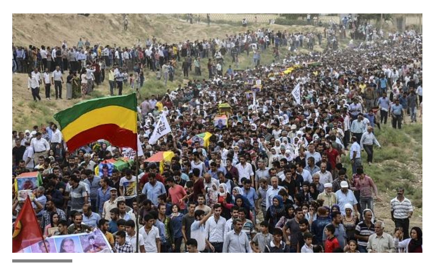
Kurds take part in funerals for people killed during clashes between Turkish forces and Kurdish fighters in Cizre on September 13, 2015, following a week-long curfew imposed to support a military operation against Kurdish fighters.

In 1920, world leaders gathered in France to draw up the Treaty of Sèvres, which divided the territories controlled by the recently dissolved Ottoman Empire. The treaty allowed for the establishment of an independent Kurdistan. Mustafa Kemal Ataturk rejected the agreement, causing the Treaty of Lausanne to replace it by 1923 – this time omitting any mention of a Kurdish homeland. This resulted in the Kurdish population being divided between Iran (8.1 million), Iraq (5.5 million), Syria (1.7 million), and Turkey (14.7 million), and constituting minorities in all states. The Kurds are the largest ethnic minority in the world without a sovereign state.