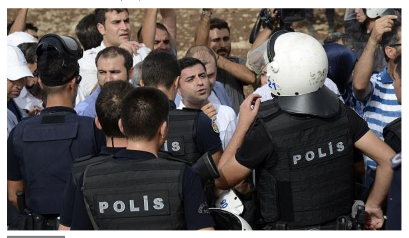
Members of Turkey's pro-Kurdish Peoples' Democratic Party argue with police as they try to enter the Kurdish dominated city of Cizre, blocked by Turkish security forces, on September 10, 2015.

The implications for people living in Turkey, and particularly those in the southeast, are devastating.