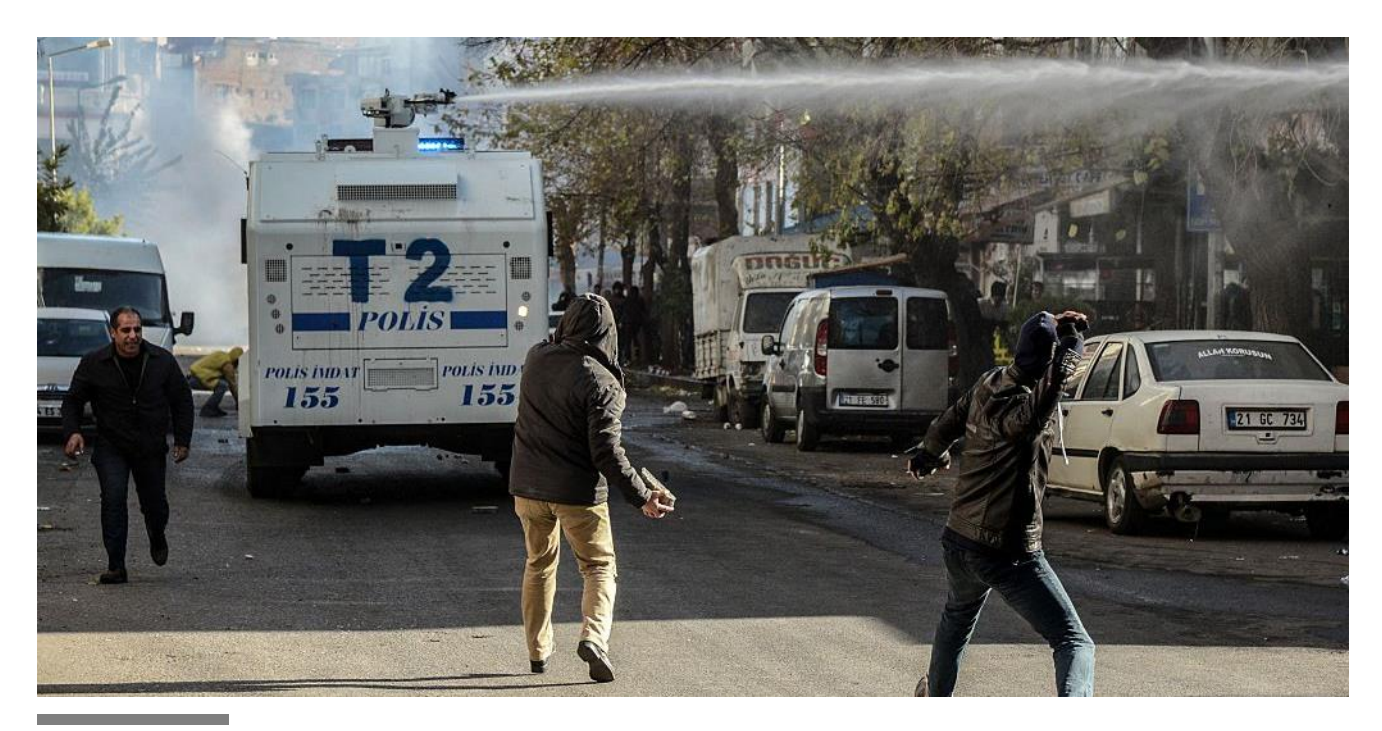
Protesters throw rocks as police use a water cannon during a demonstration in Diyarbakır on December 22, 2015 to denounce security operations against Kurdish fighters in southeastern Turkey.

However, renewed tension was already brewing. In 2014, the main Kurdish military force in Syria, the People's Defense Units (YPG),<sup>9</sup> made advances against the self-declared Islamic State (IS), also called ISIS or ISIL, which had occupied Kurdish majority areas in Syria. Iraqi and Turkish Kurds, eager to support Syrian Kurds in their battles against the IS, were stymied as Erdoğan refused to open the borders to allow fighters and convoys to cross. Erdoğan, according to media coverage, appears to view the Kurdish YPG as a threat to Turkey equal to the IS.<sup>10</sup> The Kurds in Turkey, enraged by what they perceived as Turkish support of the Islamic State against the Syrian Kurds, erupted in protests across the southeast, resulting in deaths and injuries as demonstrators clashed with security forces.<sup>11</sup> Soon afterwards, Erdoğan reversed his position on the peace talks, instead vowing to eliminate the PKK.12