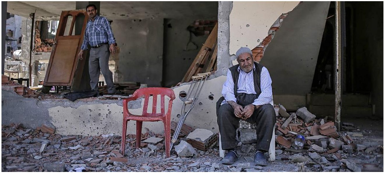
A man sits in front of his home in Cizre, destroyed by fighting between government forces and Kurdish fighters, on March 2, 2016.

Physicians for Human Rights (PHR) calls upon the Turkish government to demonstrate its respect for the rights of all citizens by ceasing unlawful practices that obstruct access to health care and by investigating all allegations of human rights abuses committed since July 2015 in the southeast, including by Turkish security forces. PHR also calls on the Turkish government to respect the rule of law and international human rights standards during the three-month state of emergency imposed on July 21, 2016. Turkey must reinstate compliance with the European Convention of Human Rights - suspended during the state of emergency – cease the blanket arrest and detention of tens of thousands of people without providing due process, and provide protection from torture and other ill-treatment for anyone detained during the government crackdown.