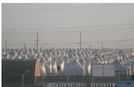
Ceylanpinar refugee site in Sanliurfa, with tents provided by the Turkish Red Crescent