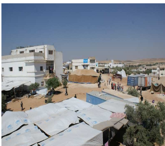
Bashabshe transit site in Ramtha, Jordan. Transit sites in Jordan are managing to cope with increased numbers of arrivals through a referral system to separate reception sites for families and singles in Ramtha and hosting opportunities with families and friends.

This weekly update provides a snapshot of the United Nations and partners' response to the influx of Syrian refugees into Jordan, Lebanon, Iraq and Turkey. The response is led by the UN Refugee Agency and is undertaken in full coordination with host Governments. This report covers the period from 5 to 12 July 2012. The next update will be issued on 19 July 2012.