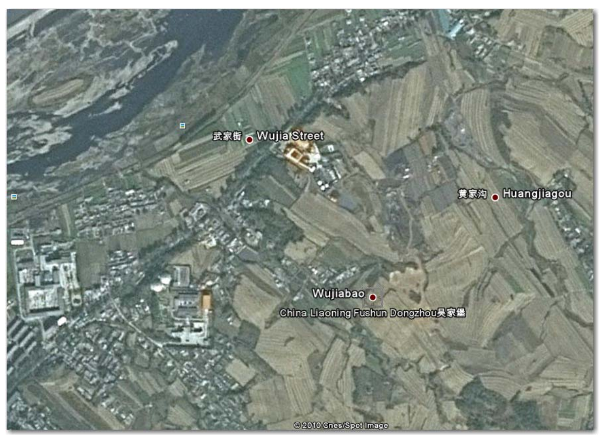
(Google Earth Photo of 'Wujiabao, Fushun City Liaoning' - Attachment 7)