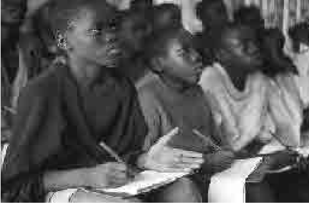
Burundi: Education often provides a brighter future. Rwandan refugee children are given educational material to attend school.

Access to refugees and spontaneous returnees, mainly in Burundi and the DRC, remained a pre-occupation due to continued insecurity in the operational areas. Logistical constraints also continued to hamper UNHCR operations.