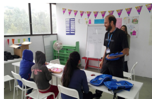
The first day of school for refugee children from Lagadikia and Derveni sites © UNHCR / October 2016