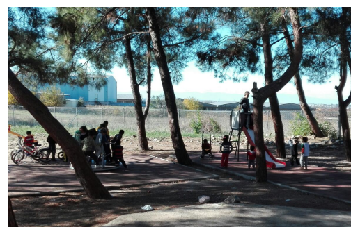
Refugee children enjoy the new playground constructed in Diavata site through one of the community-based interventions supported by UNHCR