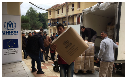
Mass winter non-food items distribution in all sites in Northern Greece © UNHCR / October 2016