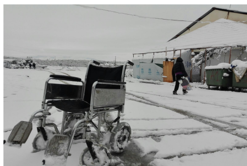
Snow covered Petra Olympou site, just after the last group of asylum-seekers was transferred by UNHCR to more suitable accommodation in apartments and hotels © UNHCR / November 2016