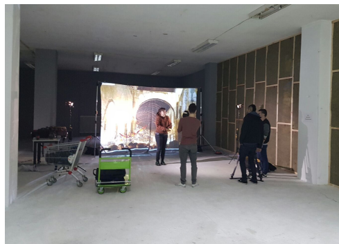
Refugee children participating in the photography/documentary seminar conducted at the Thessaloniki Film School, in collaboration with UNHCR © UNHCR / December 2016