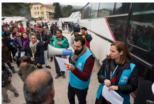
UNHCR staff organizing the transfer of over 1,100 Yazidi asylum-seekers from Petra Olympou site to appropriate accommodation facilities © UNHCR / C. Tolis, November 2016