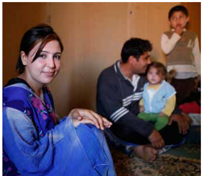
Marriage and birth certificates enhance the protection of women and children by securing their rights to family unity.

Syrian nationals in Turkey registered by the government as Temporary Protection beneficiaries enjoy free access to all forms of maternal health services, including prenatal, delivery and post-natal care, as well as prescription medication. With the issue of transportation identified as a challenge for some refugees, the government has instituted transportation assistance to bring pregnant who reside in camps to hospitals to ensure safe deliveries and the issuance of medical birth notifications.