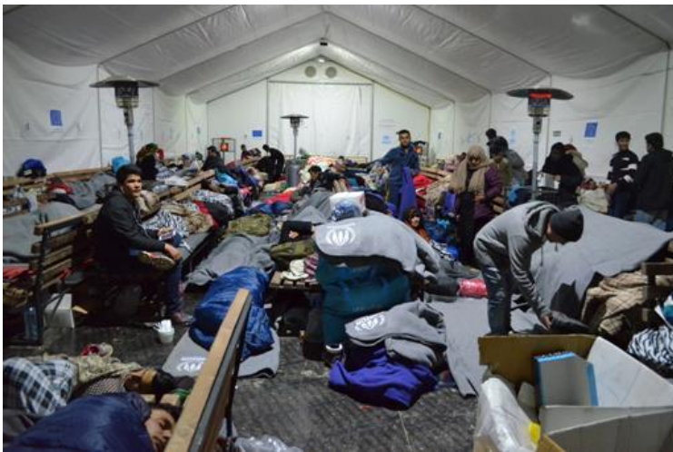
Refugees waiting in the rubhall following UNHCR distribution of blankets and sleeping bags Tabanovce transit centre (former Yugoslav Republic of Macedonia), February 2016.

As of 24 February 2016, 303 individuals were relocated out of Italy to nine Member States and 295 out of Greece, totaling 598 persons relocated so far to 15 Member States. In terms of places pledged, 19 Member States and Lichtenstein have offered relocation places.