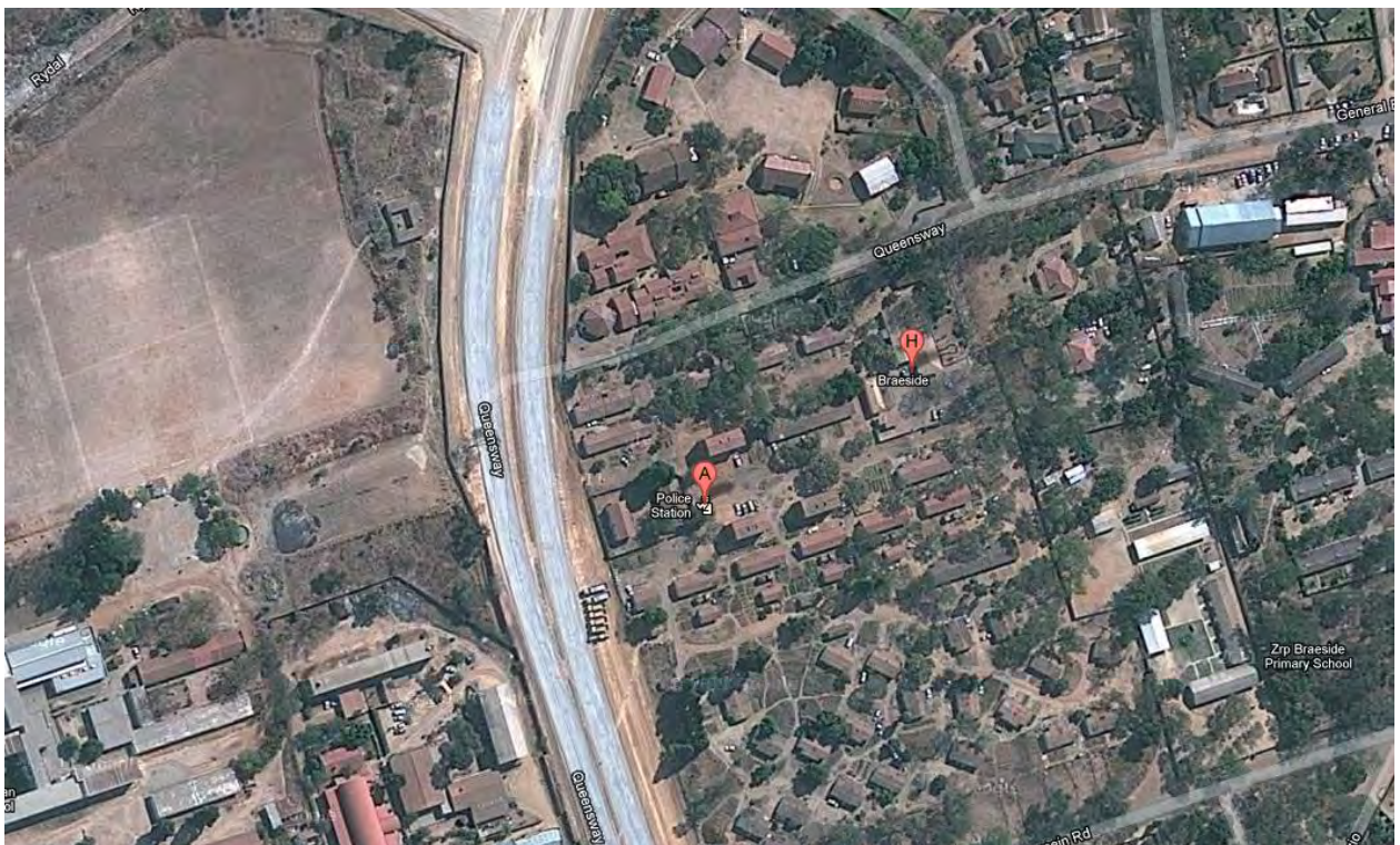
Photo 1 – Google Maps satellite photo showing Braeside Police station (marked at A). 8