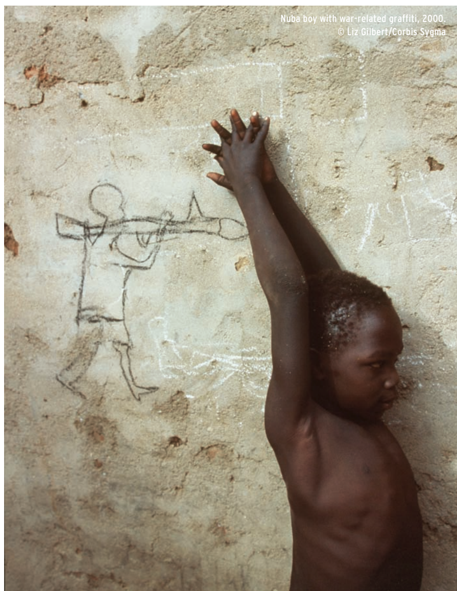
Nuba boy with war-related graffiti, 2000.

groups 29 say they detect a new dimension to the conflict, especially in the east of the mountains where an internal UN report speaks of 'an unprecedented level of insecurity', and UNMIS monitors warn that 'armed nomads (are) terrorizing villages'. Local people say this is no longer resource-related violence: young Arabs have G3 rifles—reportedly new—and talk about driving non-Arabs out of the mountains. 30 Fears were first aroused at the time of the CPA negotiations, with the emergence of a shadowy, Arab supremacist movement calling itself the Awlad al Ferek ('Sons of the Cattle Pens') that claimed the SPLA wanted to drive Arabs from the mountains. Some Nuba link the group to the Tajamu al Arabi , representing an inflammatory mix of Arab supremacy and Islamic extremism,