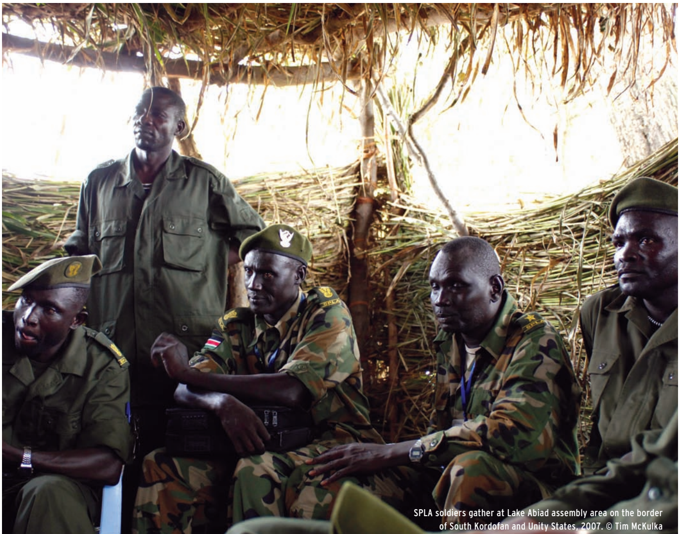
SPLA soldiers gather at Lake Abiad assembly area on the border of South Kordofan and Unity States, 2007.

Morale is low among the 3,000 men who form the SPLA component of the JIUs and who have not, according to their commander, 'received a single bullet' from the government. 52 Intended by the CPA to act as 'a symbol of national unity,' should the 2011 referendum indicate a desire for unity, the JIUs are instead a symbol of continu-