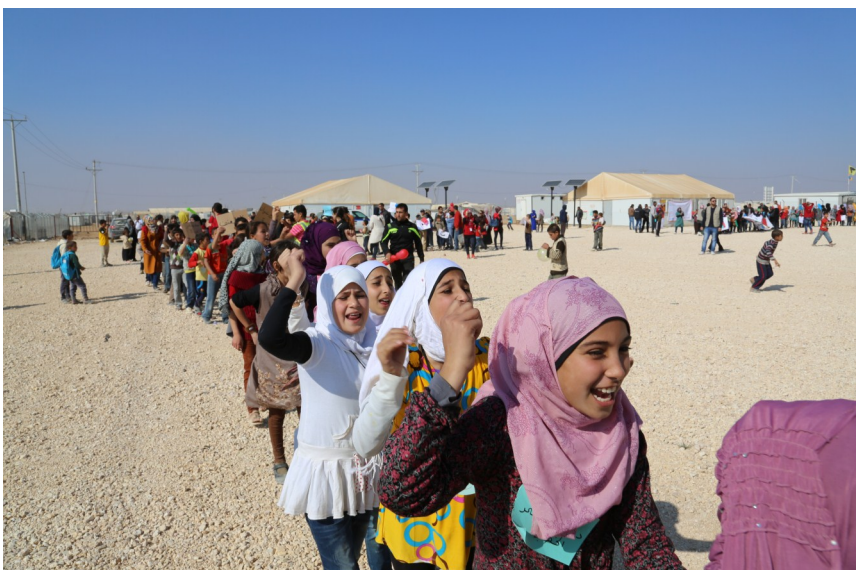
On Universal Children's Day, 20 November, approximately 600 children gathered at one of the 37 Child Friendly Spaces in Za'atri camp.

• Save the Children (SC) is carrying out a range of activities across the region to promote protection, education and the health and wellbeing of children. SC is working to provide children with school bags, uniforms, and other essential school materials, and pay school fees. They are also providing non-formal education for adolescents and Early Childhood Education for under-fives, in addition to running child-friendly and youth-friendly spaces that reach thousands of children; and carry out a range of child protection activities including resiliency activities and establishing, training and supporting community child protection committees. SC plans to reach 1.3 million beneficiaries in Syrian refugee-hosting countries by the end of 2015, including over 675,000 children.