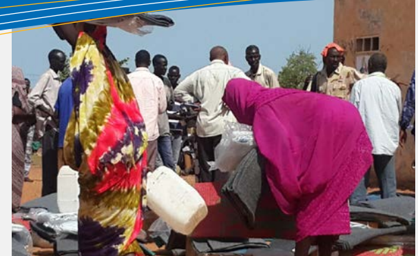
th Sudanese refugees in Kharasana (GHA)