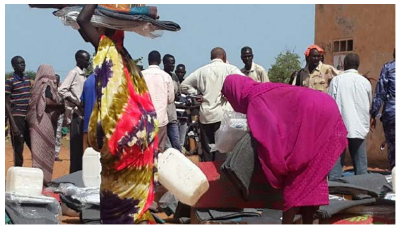
South Sudanese refugees in Kharasana. West Kordofan

Some 8,500 primary school children in Blue Nile's Geissan locality have been targeted for a school feeding programme aimed to encourage school enrolment. The Adventist Development and Relief Agency (ADRA) in Blue Nile State signed a technical agreement with HAC to implement this programme. This is the second phase of