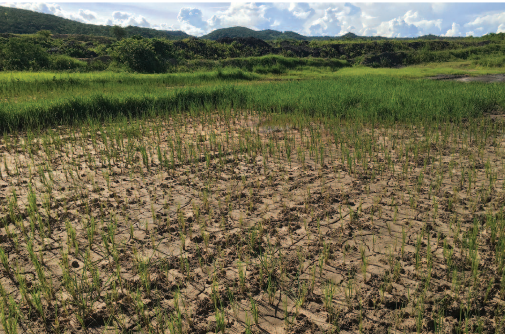
Dry rice fields by the road to Eland coal mine, Mwabulambo. Residents said that the heavy mining trucks destroyed culverts that were part of the water irrigation, decreasing their harvest.

related pollution. Several villagers also claimed that mining had destroyed water pipes or contaminated other water sources such as boreholes they depend on for drinking and irrigation. Farmers complained that dust in the air, coal on the road, and poor water quality impacted their crops and decreased the harvest of their fields, threatening economic ruin. Mining in Karonga district has also resulted in some families being resettled, often without adequate warning, decent resettlement conditions, or compensation