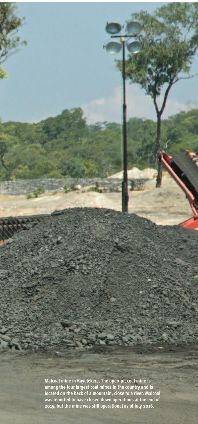
Malcoal mine in Kayelekera. The open-pit coal mine is among the four largest coal mines in the country and is located on the back of a mountain, close to a river. Malcoal was reported to have closed down operations at the end of 2015, but the mine was still operational as of July 2016.