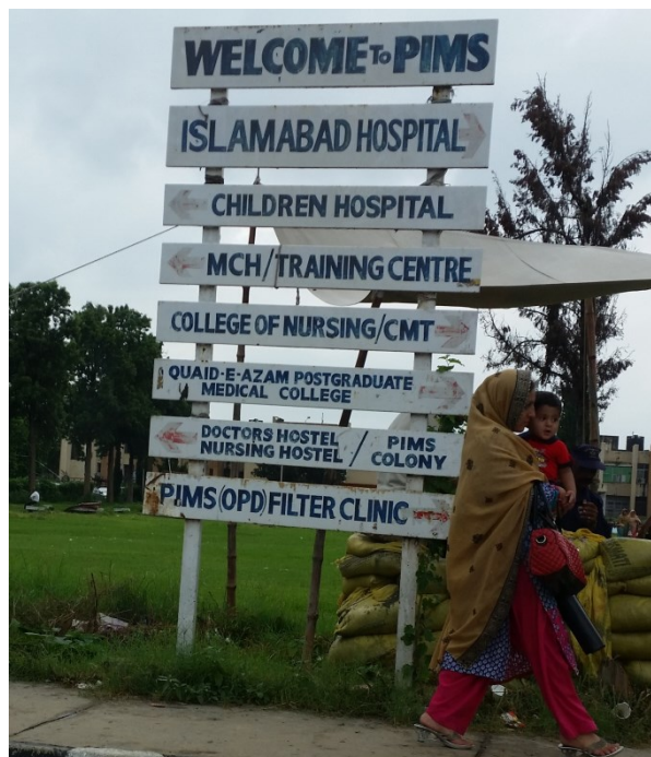
Pakistan Institute for Medical Sciences

The standard of medical care depends heavily on the clan of the patient. If the clan is actively supportive, then it is possible to find the best treatment option(s). It is important to be proactive in Pakistan when it comes to these treatment options, more so than in other countries. The clan or the family is responsible, among other things, for research into the