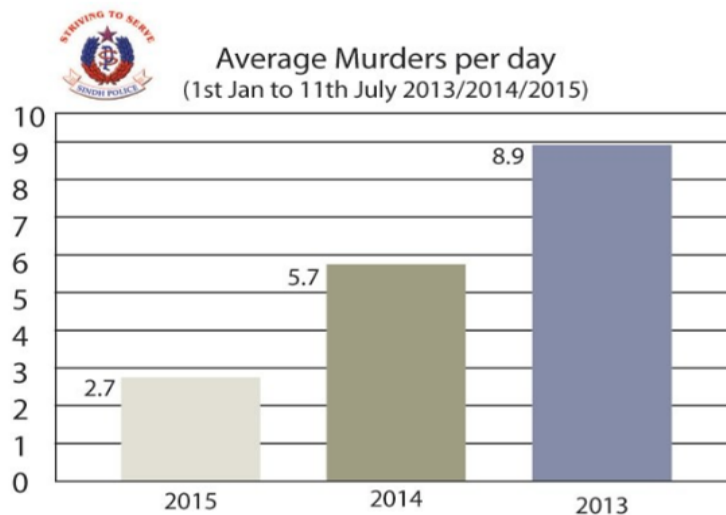
Average Murders per day 22

The Sindh home department compiled a performance report concerning the on-going Karachi operation and, according to this report, it has produced positive results. For example, the report indicates that 522 people had been killed in the first seven months of 2015, while during the corresponding period of 2014, 1,090 people had been killed. The report further indicates that in 2014, 48 kidnappings for ransom were reported by end of July, while in the same period in 2015 only one case was reported. 21