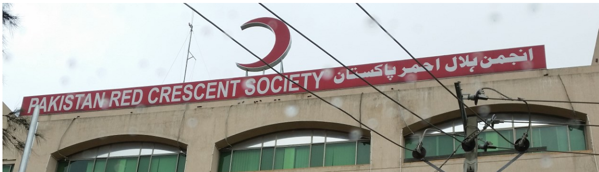
Pakistan Red Crescent Society in Islamabad

The Ministry of States and Frontier Regions (SAFRON) is proactive in regards to Afghan refugees. 218