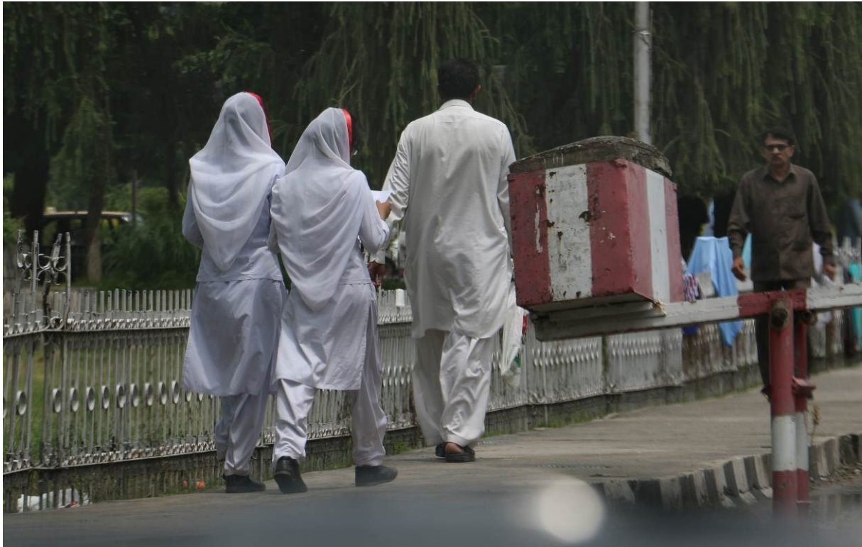
Nurses at P.I.M.S