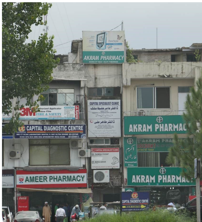
Pharmacy and chemist stores near P.I.M.S in Islamabad

Public hospitals do not have sufficient capacity for the population in Pakistan. Many medical issues cannot be treated free of charge. For instance, patients receive a list of things that are needed for the medical procedure, which can be obtained at so called “chemist shops” that can be found around hospitals. The products are sterile, and usually patients themselves have to obtain them and pay for the products. Sometimes, depending how well organized a hospital is, it provides patients with the products or supports the patients in obtaining them. 354