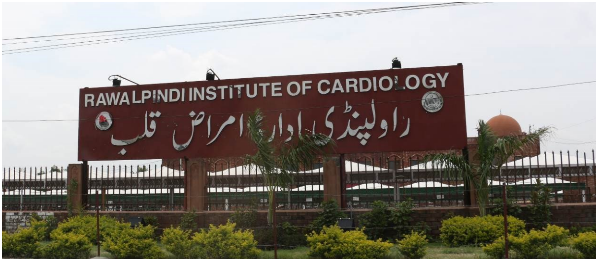
Rawalpindi Institute of Cardiology

different options for the costs of an operation, the location for the operation and so on. Furthermore, the patients occupy far less time in hospital beds in Pakistan. It is important that the family of the patient cares for the patient, as patient care is not extensive at Pakistani hospitals, as there is insufficient staff and the beds have to be made available for further patients. Relatives must care for the patient and the family is trained by the nurse. Furthermore, sanitation of the patient is the family's job. The cohesion of the family in Pakistan is very strong. 348 Insurance programs that are common in Western countries, such as medical insurance schemes are only available to a limited extent. 349