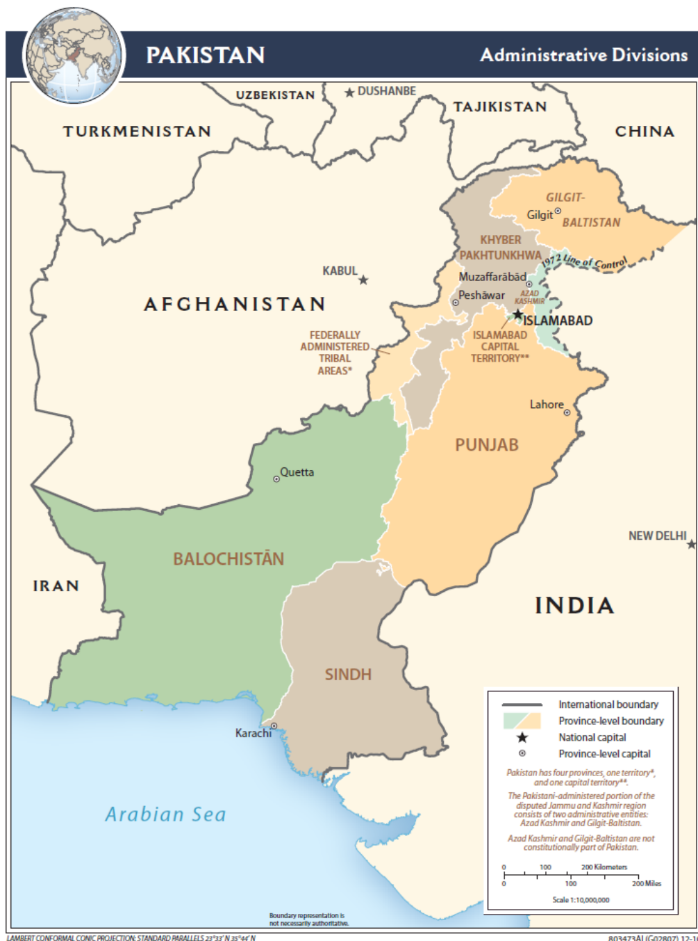
Pakistan Administrative Divisions 6

At the time of writing, the overall security situation in Pakistan is better, when compared to the period of the Austrian Fact Finding Mission 2013, 7 but remains a long way from completely satisfactory. 8 One of the local experts stated that the “security situation has