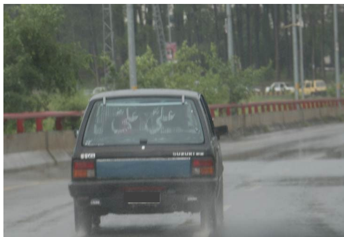
Members of the Shia faith expressing their religious beliefs 331

Targeted killings exist and those who have been particularly targeted include pilgrims, religious places and worshipping places. The government is taking steps to provide security, which has led to a reduction in sectarian incidents. According to a representative of PIPS, “Sunni leaders and Shia leaders kill each other”. 330