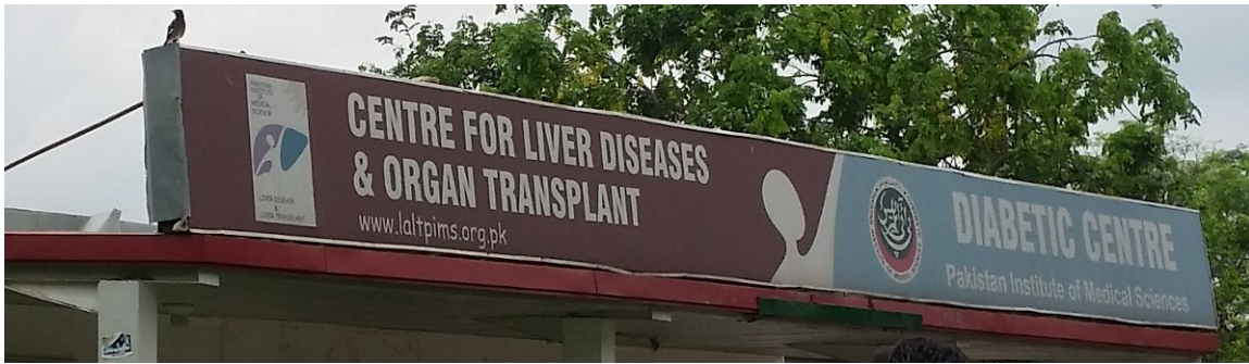
Centre for Liver Diseases & Organ Transplant and a Diabetic Centre at Pakistan Institute for Medical Sciences

A three-tier medical system exists in Pakistan: