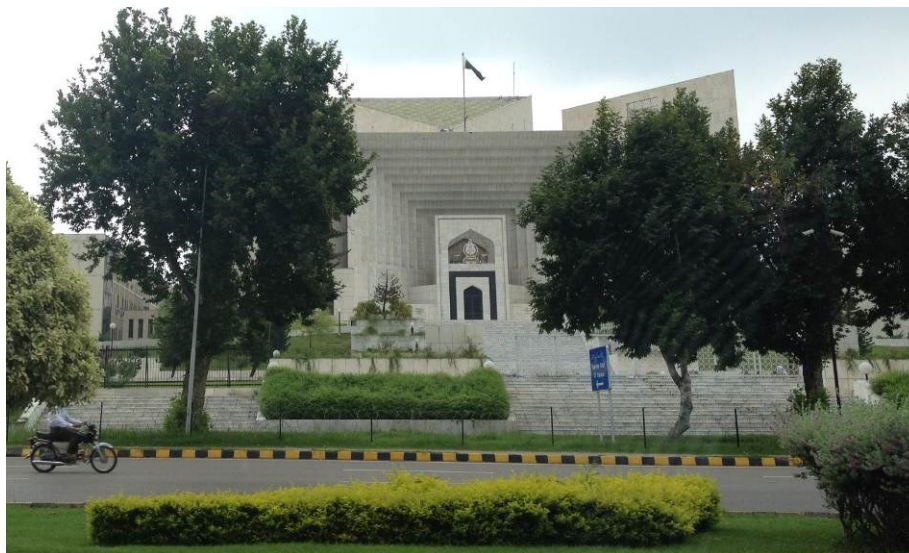
Supreme Court Islamabad

In addition to the separate administration, the judicial system in FATA is completely different to the rest of the country and the court structure of the rest of Pakistan does not have jurisdiction over FATA. Thus, there are no District Courts, High Courts or Supreme Court. Nonetheless, the people of FATA have their own justice system that is highly regarded by the people of FATA as it is cost effective and expeditious. 59