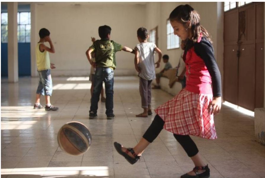
Response partners continue to organize activities for Syrian refugee children in the Bekaa Valley, Lebanon.