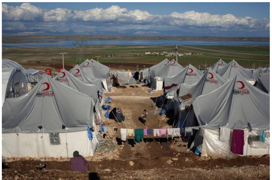
A Syrian child stands amid tents provided by Kızılay, the Turkish Red Crescent Society, for refugees residing in Adiyaman refugee camp. UNHCR provides technical support to the Turkish Government in assisting the refugees.