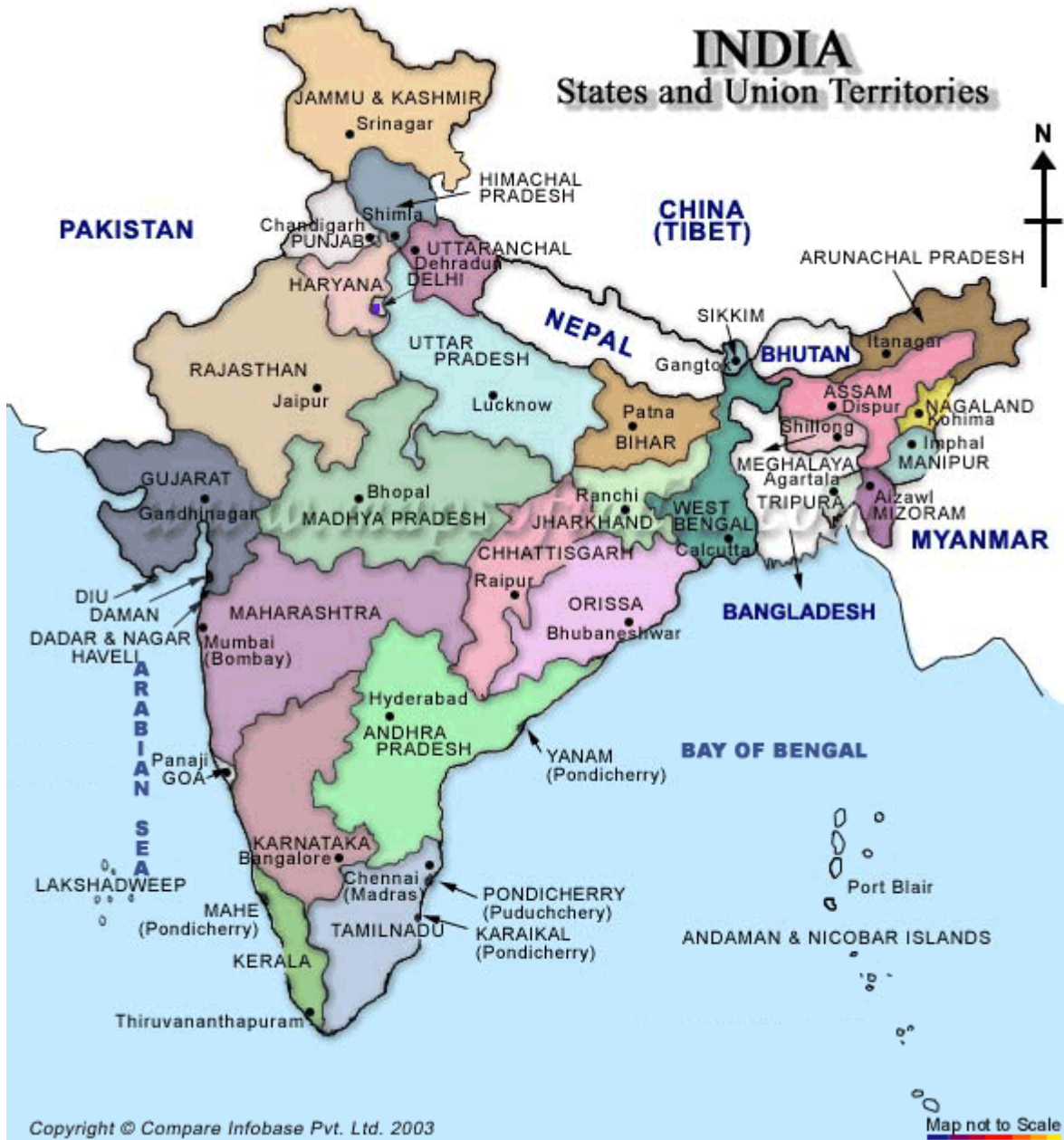
State & Union Territories