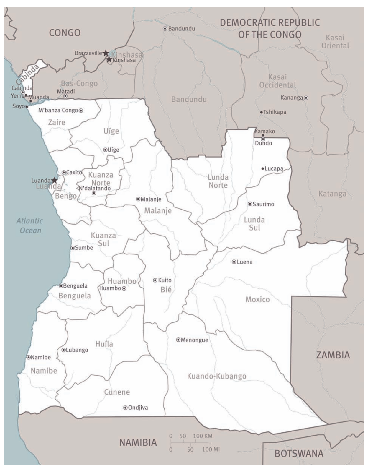
Map of Angola.