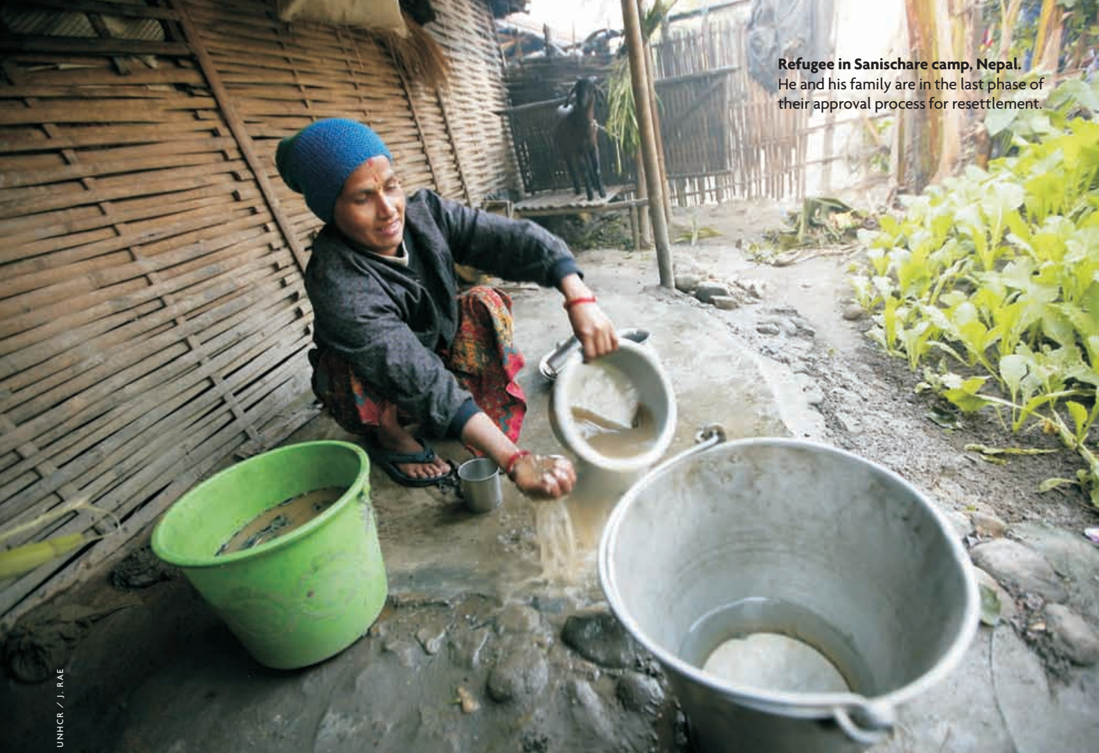
Refugee in Sanischare camp, Nepal. He and his family are in the last phase of their approval process for resettlement.