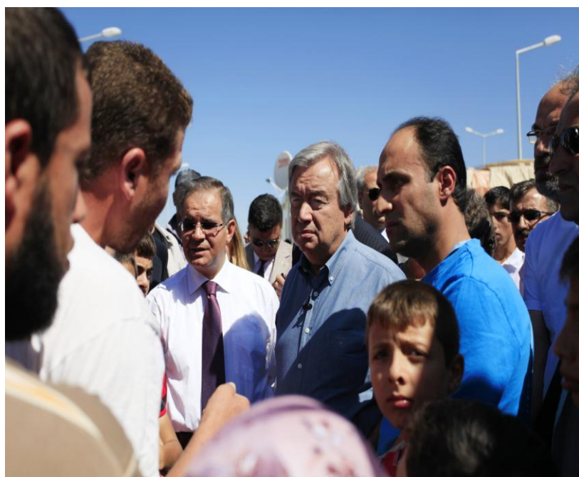
The High Commissioner, Mr. Antonio Guterres, meets with Syrian refugees during his visit to one of the refugee camps in Turkey

This weekly update provides a snapshot of the United Nations and partners' response to the influx of Syrian refugees into Jordan, Lebanon, Iraq and Turkey. The response is led by the UN Refugee Agency and is undertaken in full coordination with host Governments, UN agencies, and NGO partners. This report covers the period from 08 to 14 September 2012. The next update will be issued on 21 September 2012.