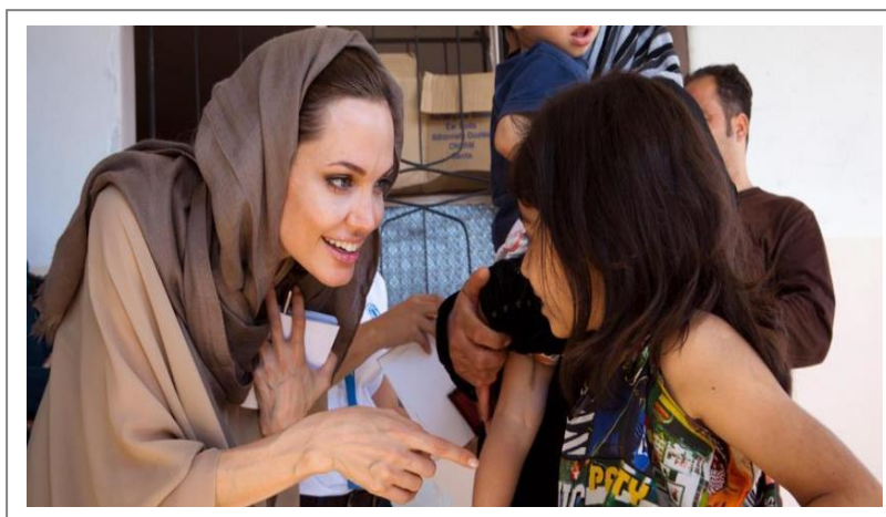
UNHUC SE, Ms. Angelina Jolie, during her visit with the HC to one of the refugee camps in Turkey