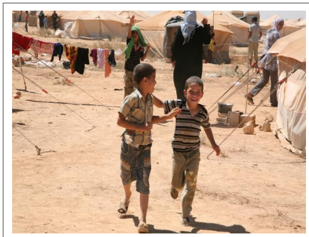
Syrian refugee children at the Za'atri camp