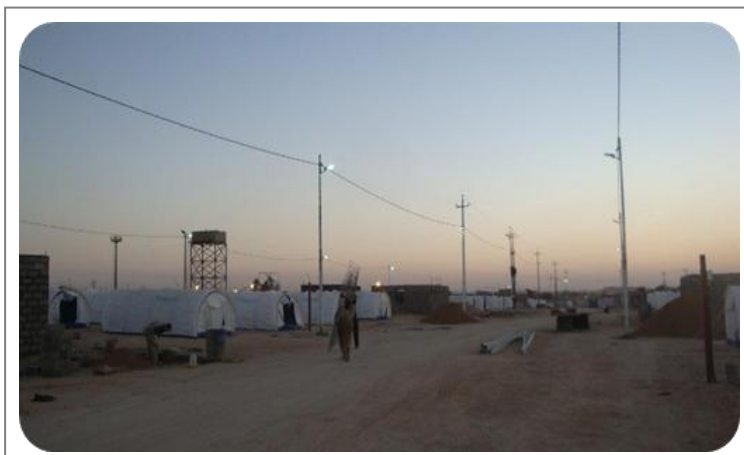
One side of Al-Qaim refugee camp