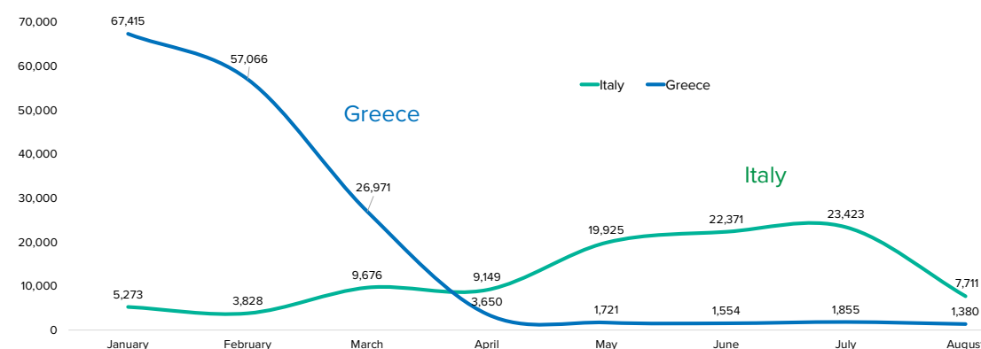
Average Arrivals to Greece and Italy per Month January to 14 August 2016

During the week, an average of 1,123 people were waiting in the north of Serbia each day for entry to Hungary, with hundreds near the two official transit zones,