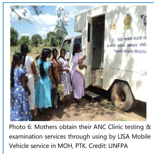
Photo 6: Mothers obtain their ANC Clinic testing & examination services through using by LISA Mobile Vehicle service in MOH, PTK.