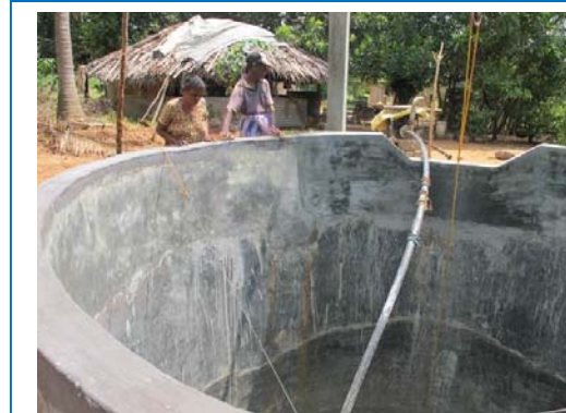
Photo 8: Well construction completed in Thunukkai, Mullaitivu.

Ayurvedic centre in Pambaimadu received a recharging system. The Thalinkulam Government Tamil-Medium School rainwater harvesting system was handed over in June by the Minister for Water Supply and Drainage. Fifty vulnerable households in Cheddikulam DSD (Andiyanpuliyankilam), and 50 vulnerable households in Vavuniya DSD (Kathar sinnakulam and Sri Ramapuram GND), received rainwater harvesting systems. Of the total need of 750, 102 systems have been completed so far.