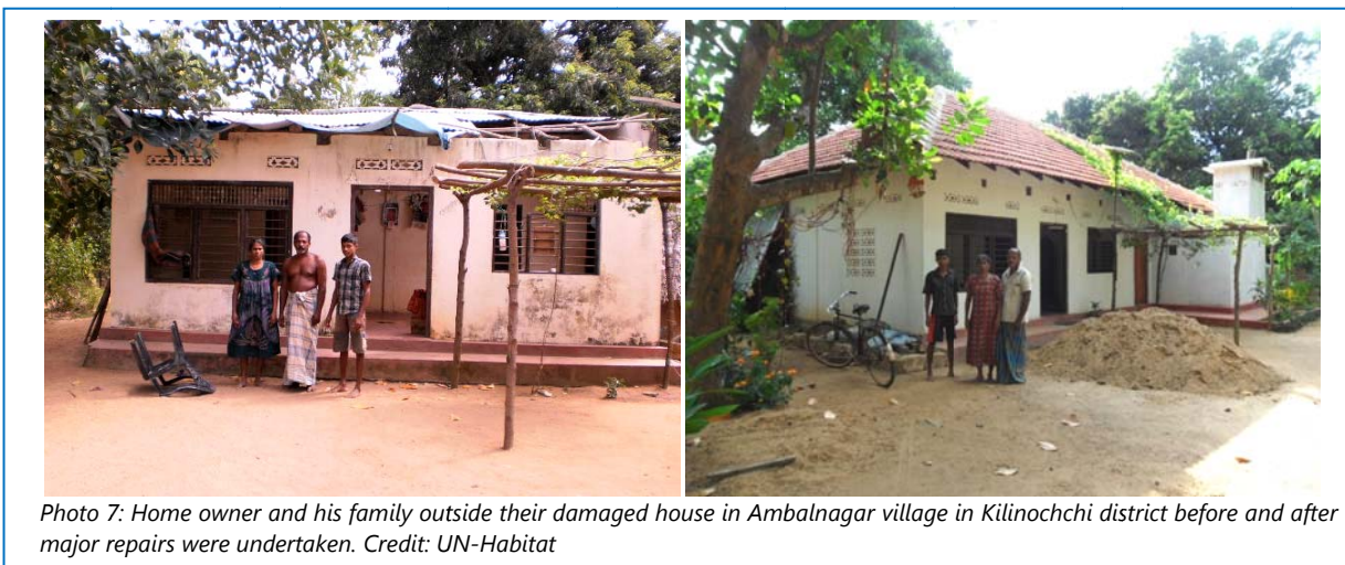
Photo 7: Home owner and his family outside their damaged house in Ambalnagar village in Kilinochchi district before and after major repairs were undertaken.