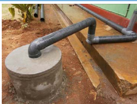
Photo 9: Recharging System Well construction completed in Thunukkai, Mullaitivu.