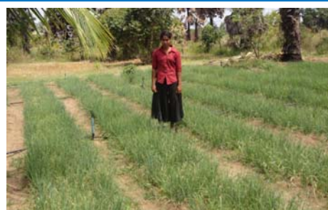
Photo 3: Sprinkler irrigation at Eluthumadduval North.