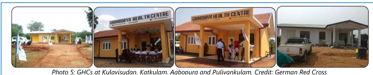
Photo 5: GHCs at Kulavisudan, Katkulam, Aabopura and Pulivankulam.