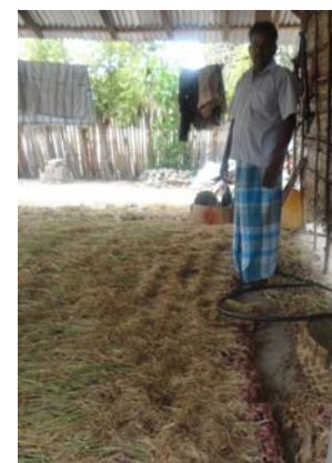
Photo 4: Beneficiary with Harvested Onion Vaththirayan South.