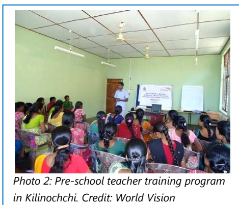
Photo 2: Pre-school teacher training program in Kilinochchi.

district for those students who lost education due to war and other socio-economic factors.