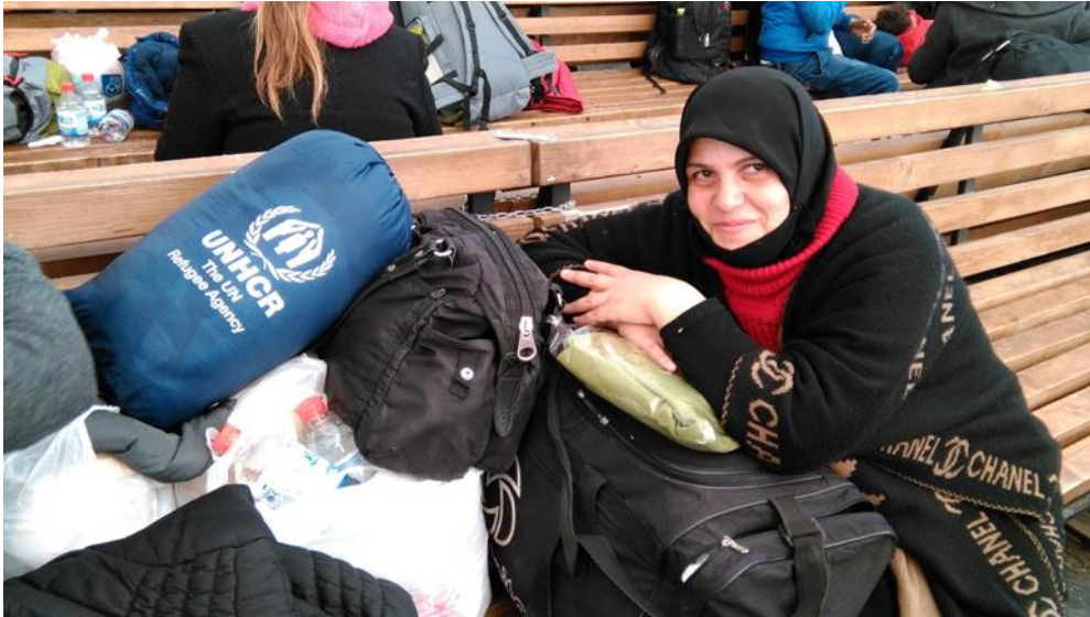
A refugee received a new UNHCR sleeping bag in Vinojug reception centre, former Yugoslav Republic of Macedonia

As of 10 February 2016, 497 persons relocated so far to 12 Member States (279 individuals were relocated out of Italy and 218 out of Greece). In terms of places pledged, 17 Member States and Lichtenstein have offered relocation places.