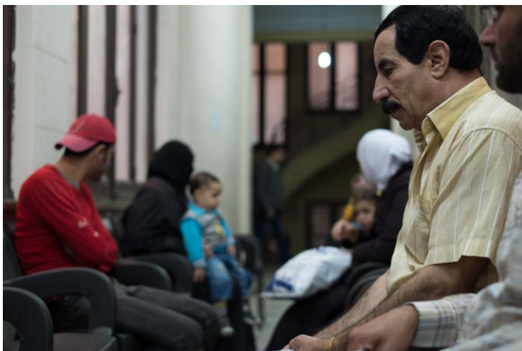
Syrian refugees in the reception area of Caritas Alexandria awaiting an interview with social workers. Caritas Alexandria provides counselling, cash assistance and health care services to Syrian refugees.

On 21 May, UNHCR held a meeting with the Syrian community in Haram and Faysal to raise awareness on residency issues and, particularly, the risks of irregular movements, and on the resettlement process – stressing that it was done exclusively through UNHCR and always for free. At the end of the meeting, UNHCR identified several vulnerable cases and referred them to the concerned units.