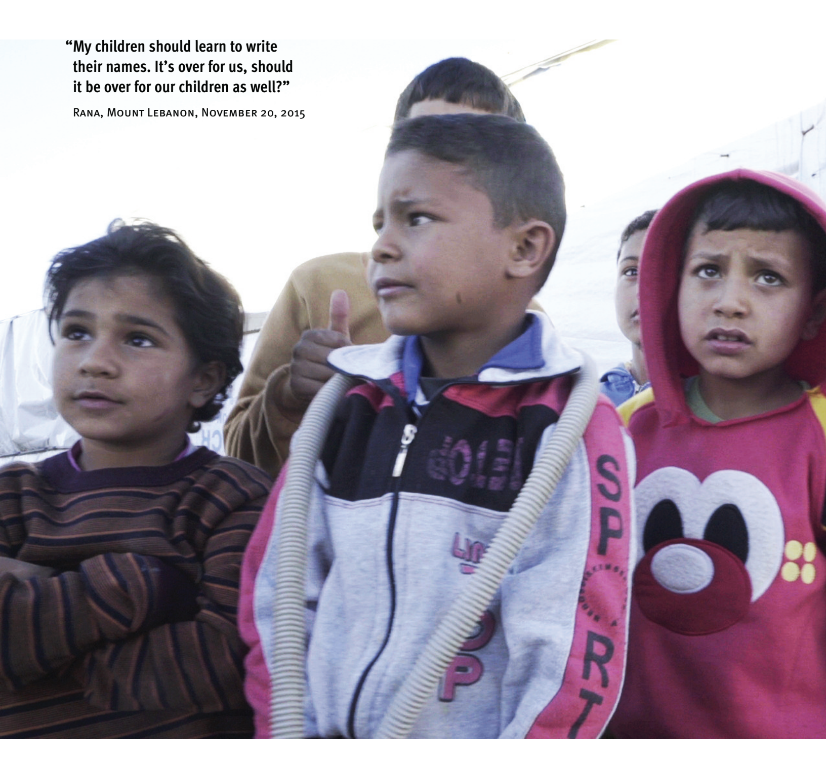
Syrian children in an informal refugee camp in the Bekaa Valley.