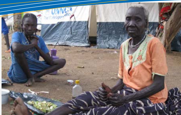
Sudanese refugees in South Sudan