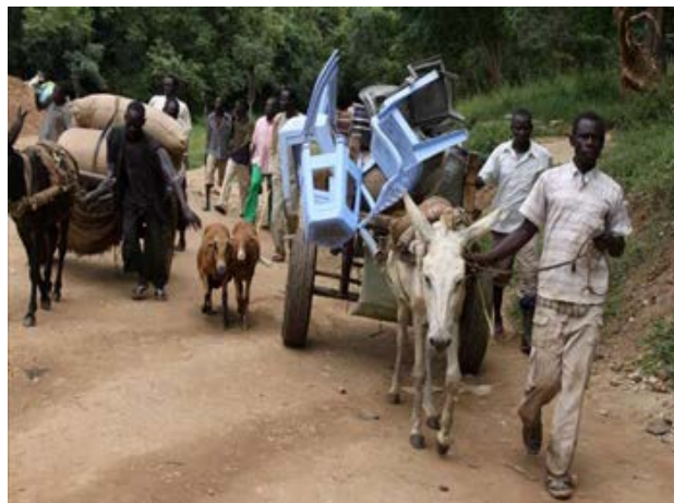
Refugees from Blue Nile crossing the border into Ethiopia (UNHCR)

On 11 November, an estimated 2,000 people fled their homes in Baldogo village (34km south of Bau town, Bau locality) in Blue Nile State and walked eight days to South Sudan's Albonj area, according to reports received by the UN. According to the reports, people fled their homes out of fear over the possibility of SAF attacks in the area. This information has not been verified independently as there are no humanitarian organisations operating in the area. According to the UN Refugee Agency (UNHCR), some 231,000 Sudanese refugees from South Kordofan and Blue Nile have sought shelter in camps in South Sudan and Ethiopia since June 2011. This includes over 198,000 refugees in Unity and Upper Nile states in South Sudan and a further 33,000 refugees (mainly from Blue Nile) in camps in the Assosa region of Ethiopia.