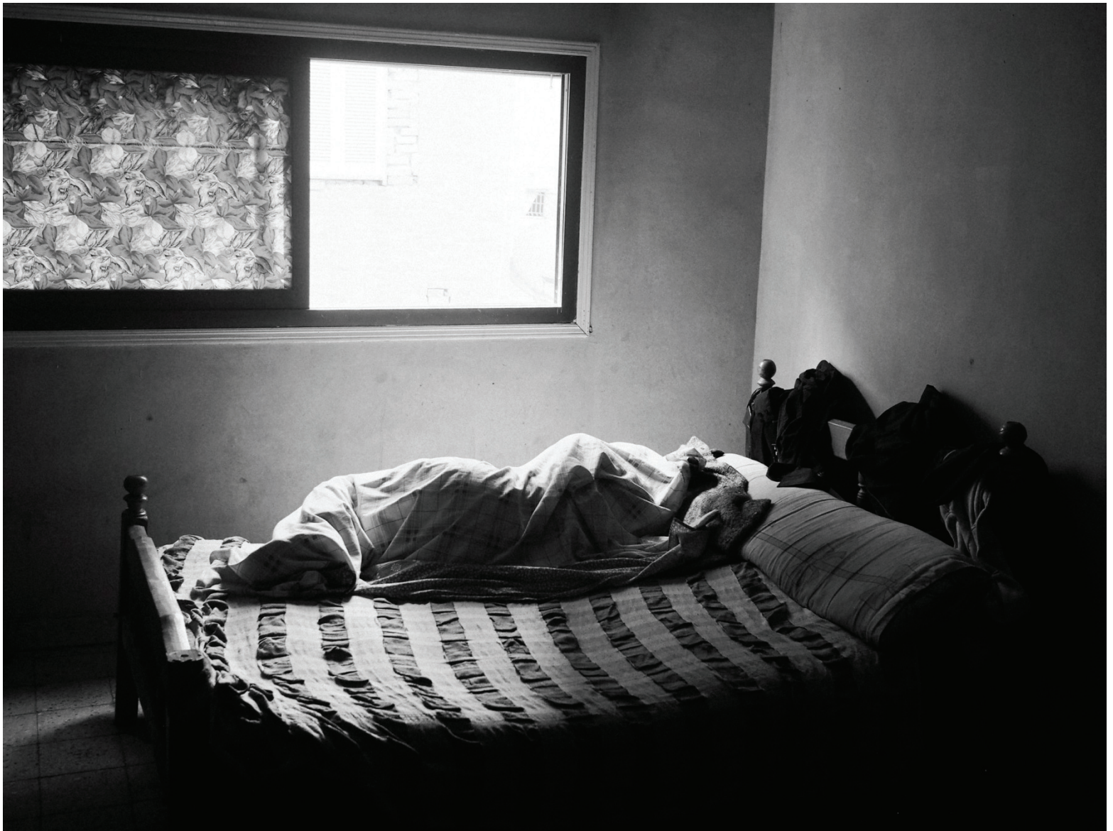
An Eritrean trafficking victim sleeps at a safe house in Cairo, Egypt on May 2, 2013. Some trafficking victims who escape from or are released by their captors in Sinai find their way to Bedouin community leaders who help them travel to Cairo where various NGOs help them.