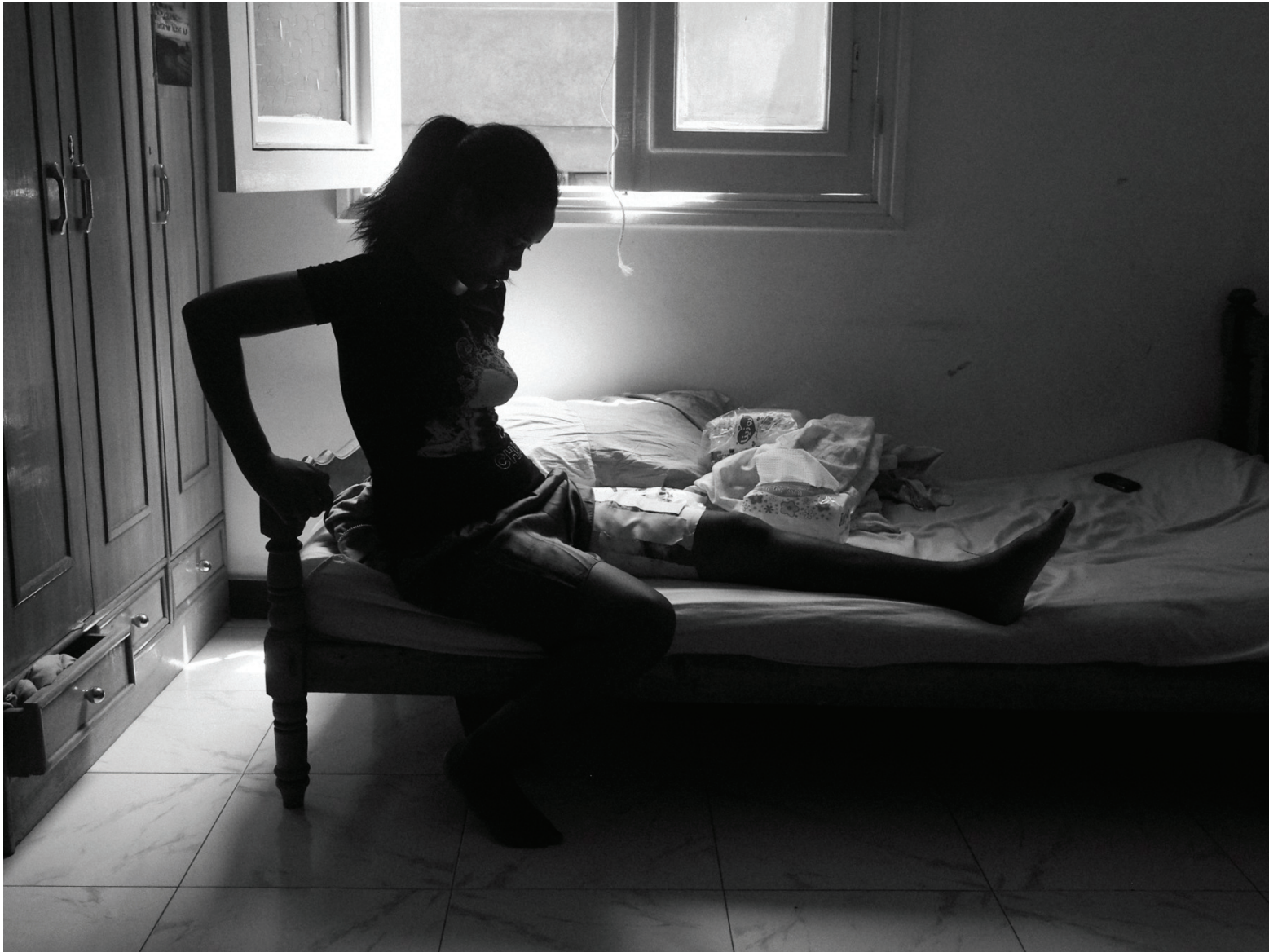
An Eritrean trafficking victim recovers from skin transplant surgery in Cairo, Egypt after traffickers in Sinai chained her ankles causing a severe infection. Trafficking victims have described to Human Rights Watch and other NGOs how traffickers chained them—often to one another—for months on end, while abusing them, including by raping women in front of other trafficking victims.